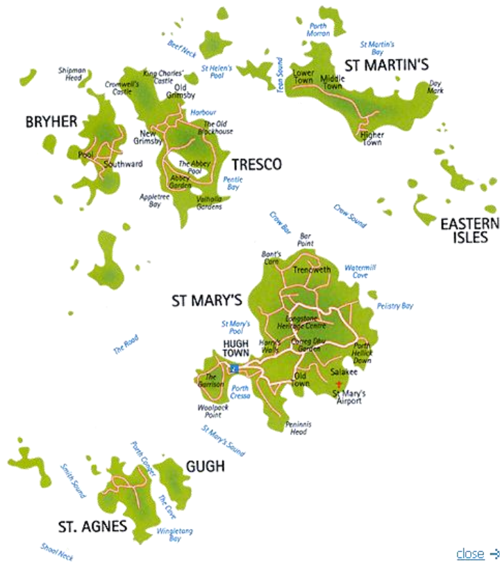
close → Fig 1 – Map of the Isles of Scilly

1.10 The Isles of Scilly are connected to the mainland UK, and the wider economy, through air links with Lands End, Newquay and Exeter and sea links with Penzance. These links are vital for the economy of the islands and for the long term sustainability of the islands' community. The air links are responsible for around 65% of passenger transport whilst the majority of the 14,000 metric tonnes of freight per annum required to sustain businesses and the community are delivered by sea.