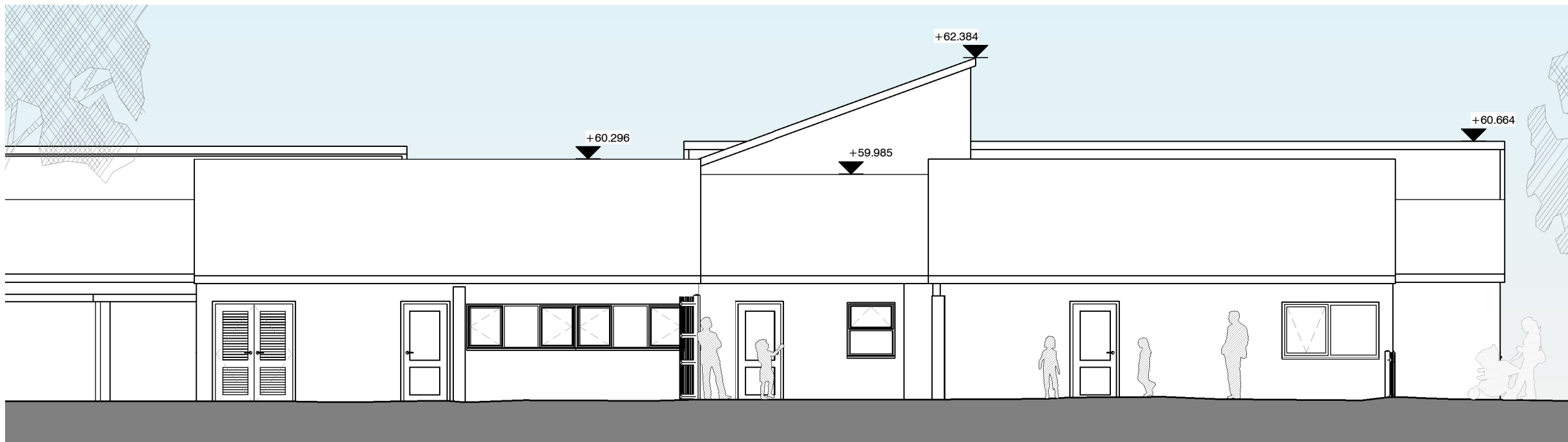
Existing Elevation B_West 1 : 100