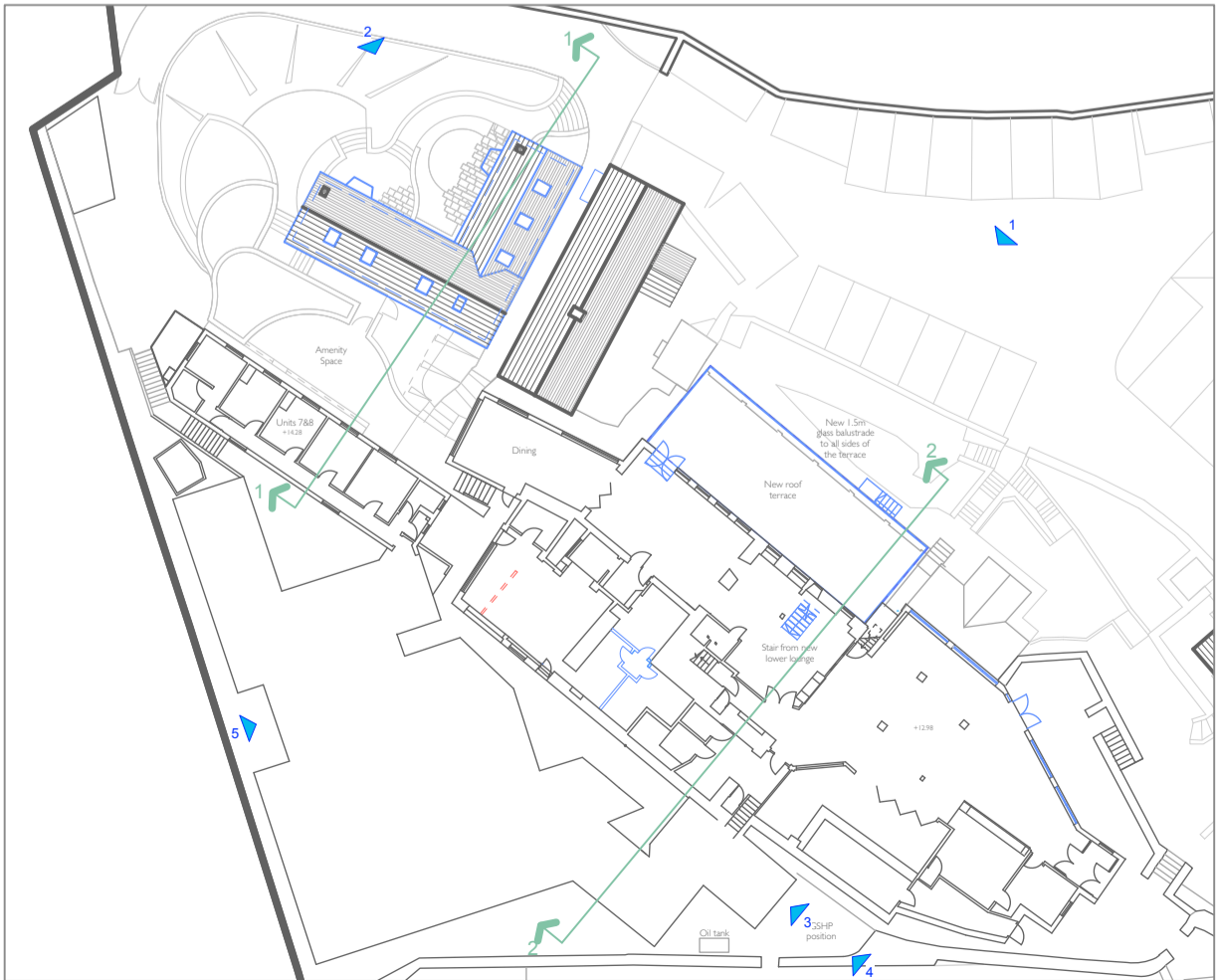
Elevation Key (NTS)