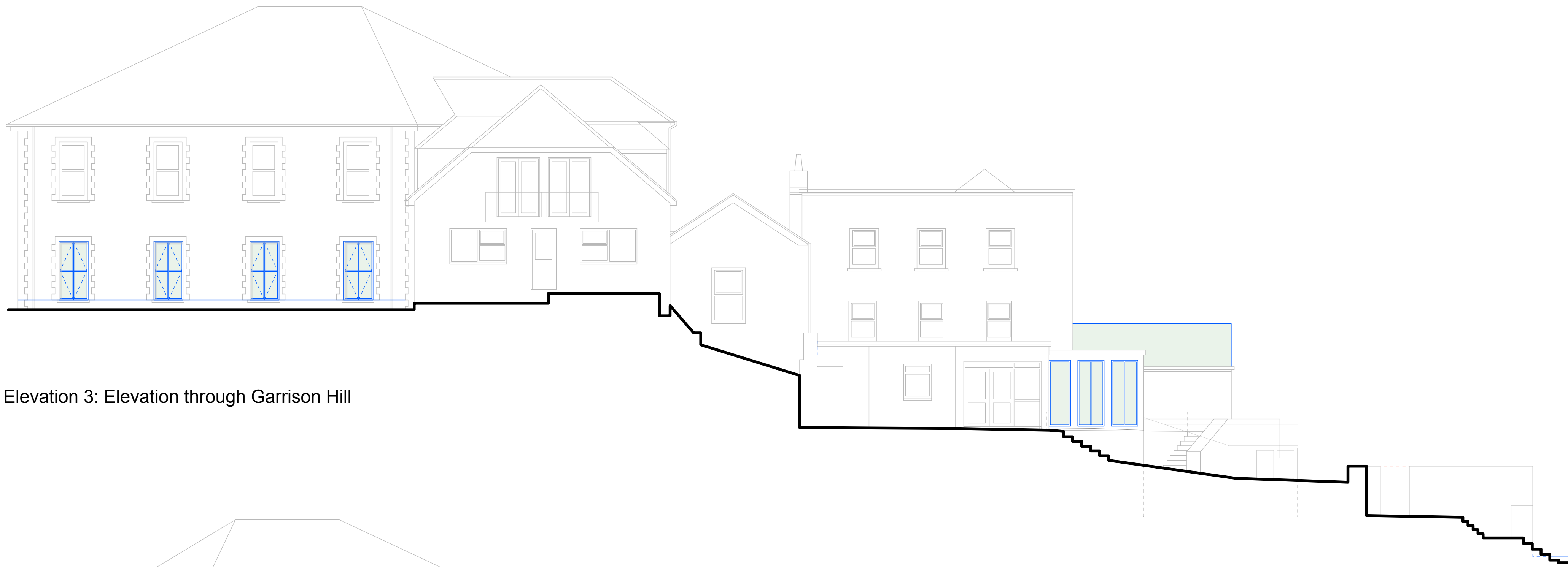
Elevation 3: Elevation through Garrison Hill