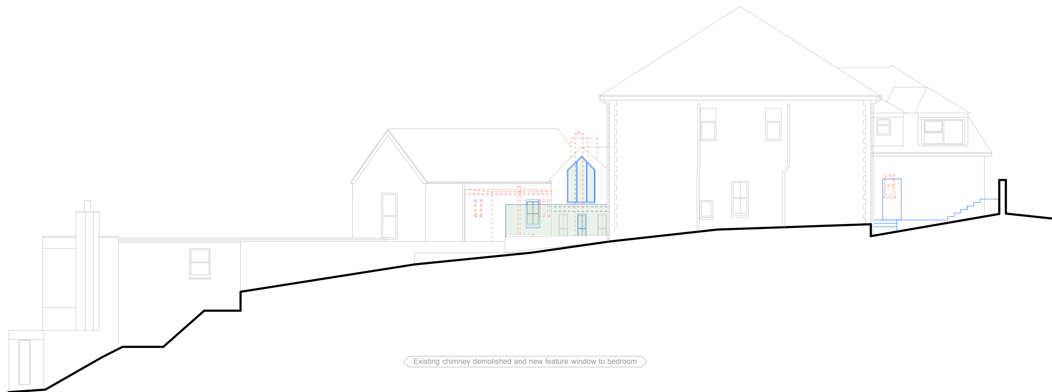
Elevation 5: Elevation from the top of Garrison Hill (hidden behind Garrison Wall)