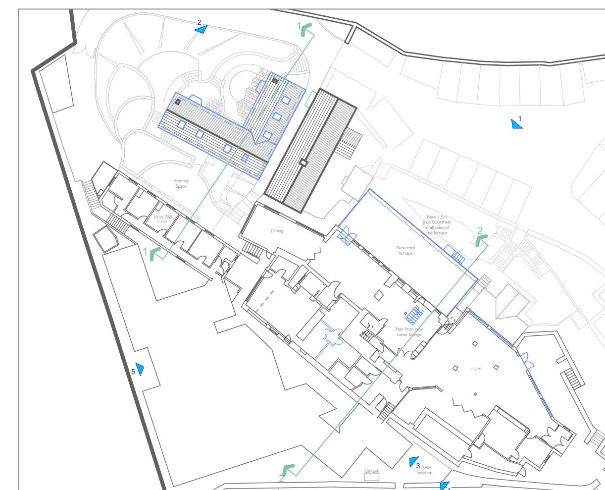
Elevation Key (NTS)