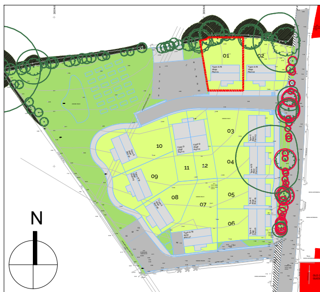
Site Plan (not to scale)