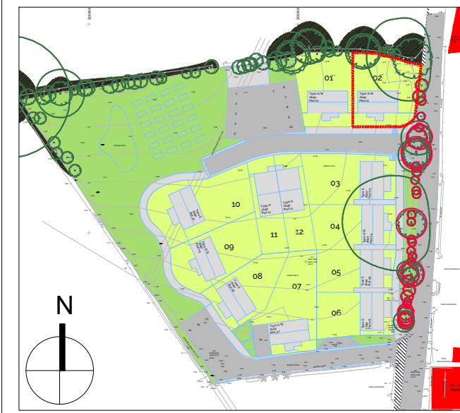
Site Plan (not to scale)