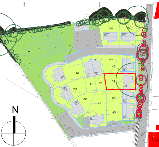
Site Plan (not to scale)