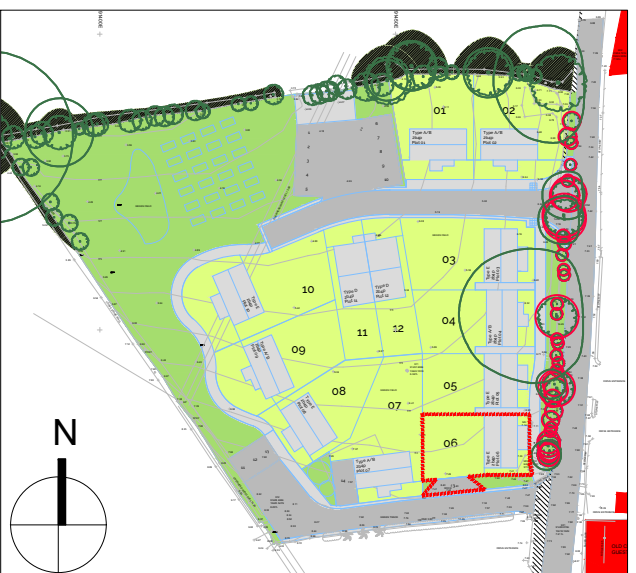
Site Plan (not to scale)