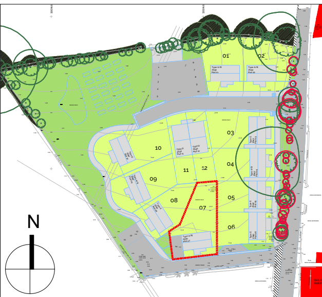
Site Plan (not to scale)