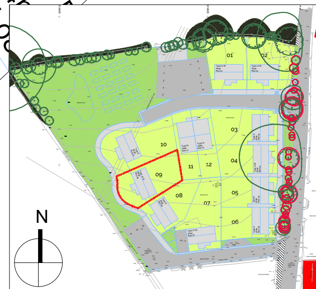
Site Plan (not to scale)

Contractors to check all dimensions on drawing. Any discrepancies must be reported to Kensington Taylor or the contract administrator before proceeding. Do not scale from planning drawings, work to figured dimensions. This drawing must be read in conjunction with all relevant consultants drawings. This drawing © Kensington Taylor Architects.