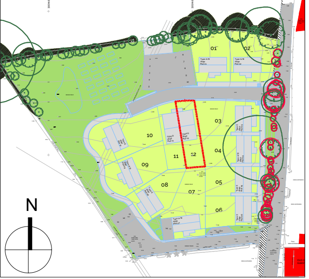
Site Plan (not to scale)

*Position will be dictated by back edge of curb from footpath