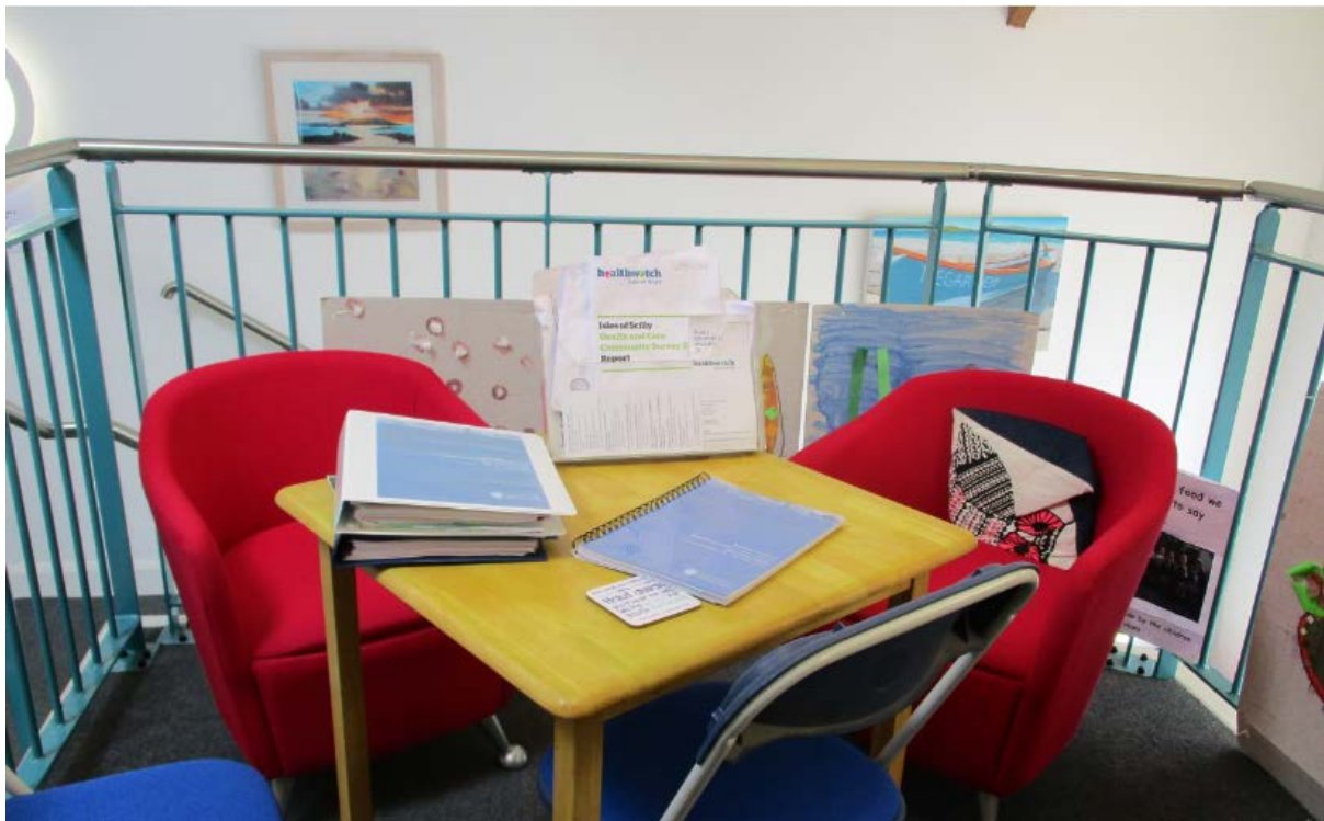
Figure 1 Deposit Venue: St Mary's Library, Local Plan on Display