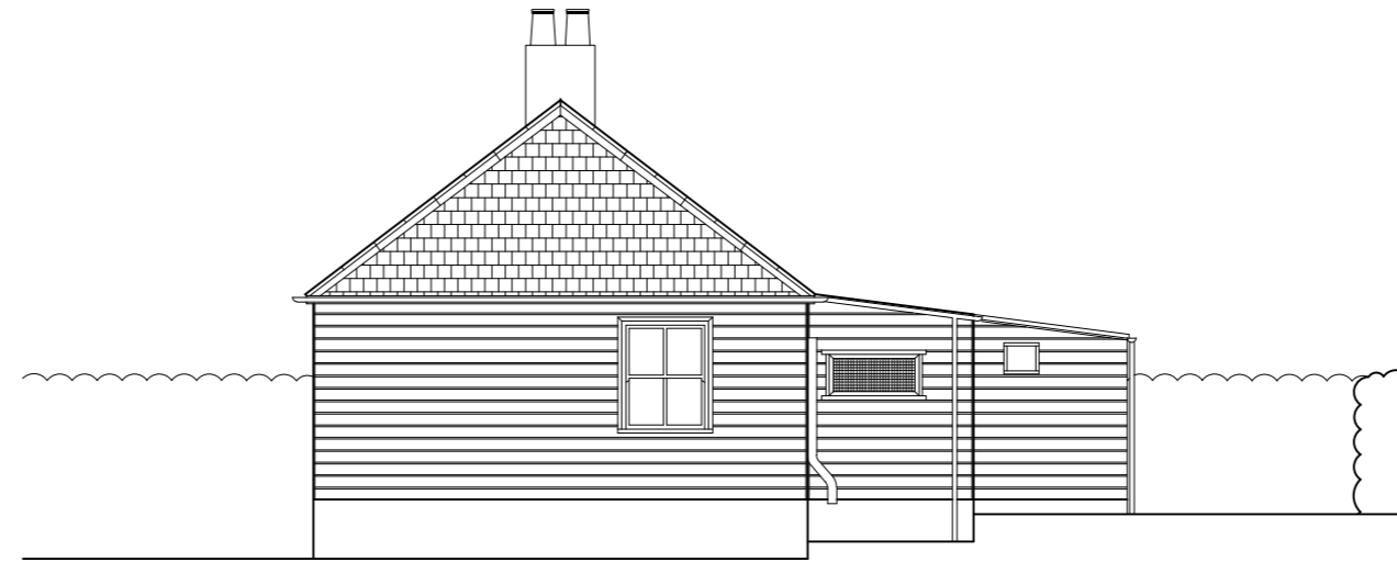
Datum 5.00m East elevation