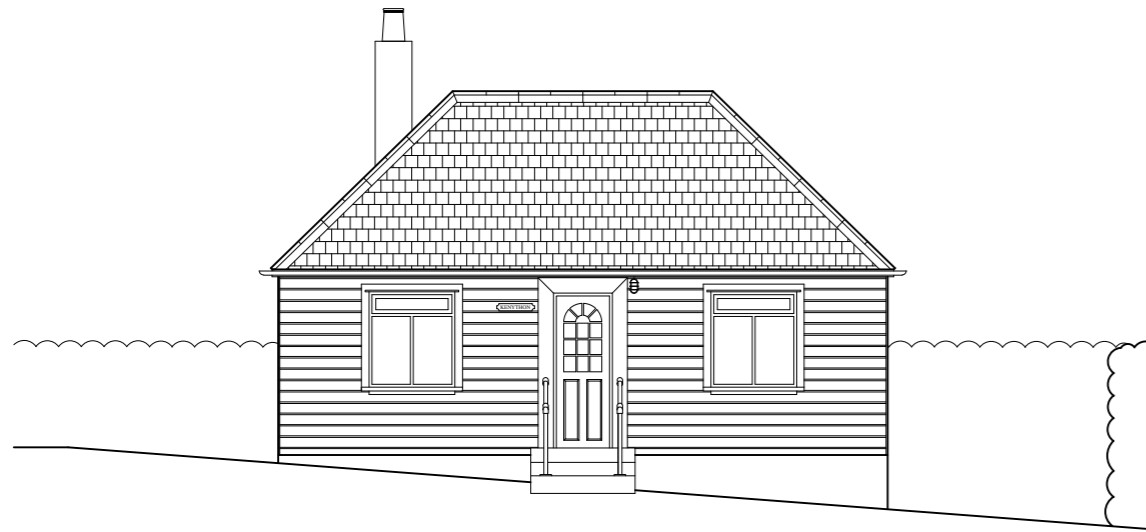
Datum 5.00m South elevation