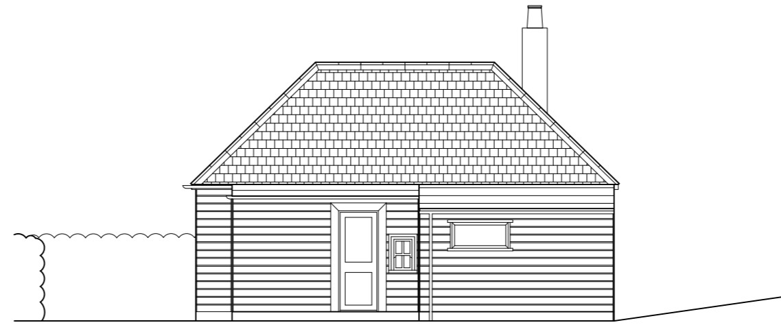
Datum 5.00m North elevation