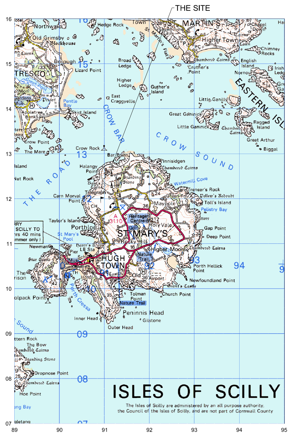
LOCATION PLAN SCALE 1:50,000