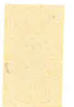
County Cream u/c Off White