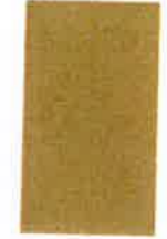
Ochre Sand # u/c Old Gold