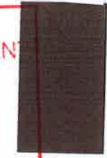
Conifer u/c Dark Grey

RECEIVED BY THE PLANNING DEPARTMENT 27 JAN 2015