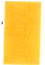
Tuscan Yellow # u/c Silver Grey