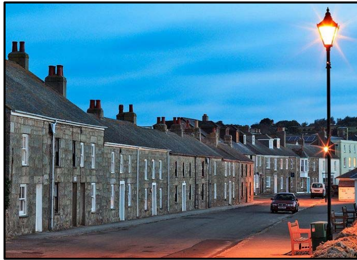
Image 8 - Cottages 1 to 10, High Strand