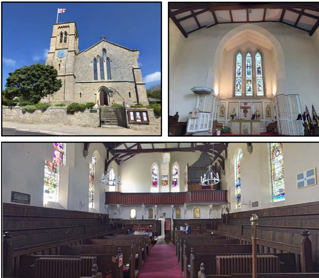
Image 3 - St Marys Church, Church Road

1.2.8 The Church of St Mary (See Image 3) occupies a site on the north-western side of Church Road at the end of Church Street. The church's construction began in 1836 and was completed in 1838. The church has been Grade II listed since February 1975.