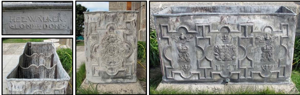
Image 4 - Lead Cisterns at the Church of St Mary's