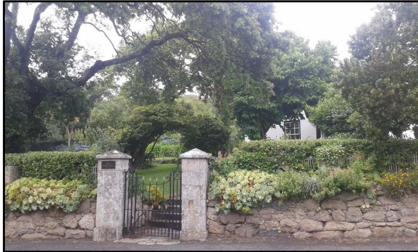
Image 6 - The Chaplaincy & Listed Gateway