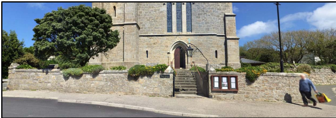
Image 5 - Gates at the front of St Mary's Church