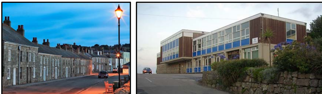
Image 9 - Image to Illustrate Detriment to the Conservation Area