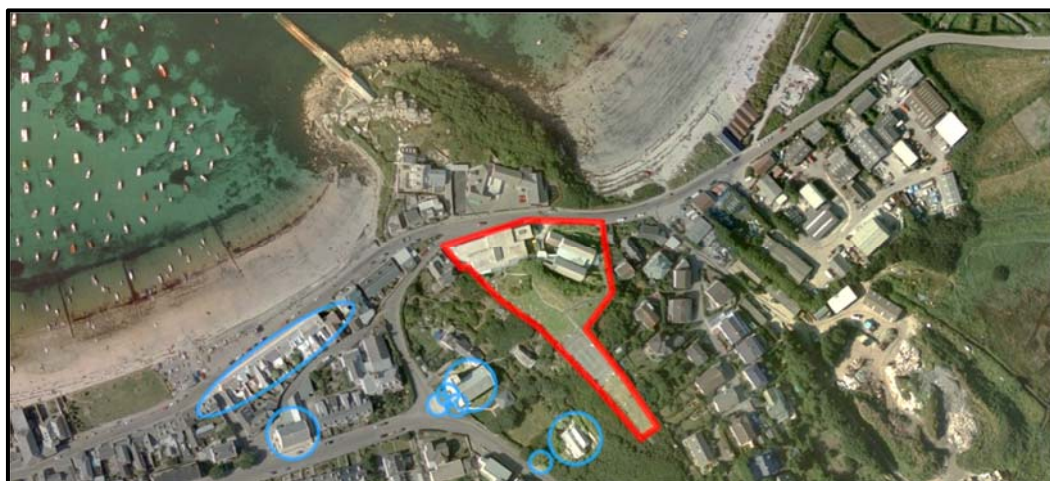
Image 2 - Image Indicating Listed Buildings (Blue) & the Sites Boundary (Red)

1.2.6 The former Carn Thomas Secondary School is situated along Telegraph Road, close to the centre of Hugh Town. The buildings are not listed and are not adjoined to any listed buildings. However, the site does lie in close proximity to a number of buildings that are listed, all within a 150m radius (See Image 2).