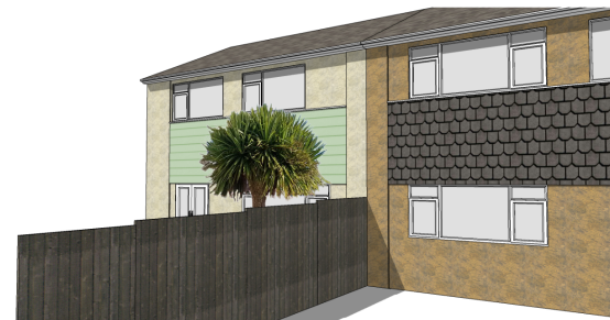
Rear view from East

Scale (Printed on A4) - 1:200 Drawing Number- Existing Plans rev 1 Correct as of 2015/12/09