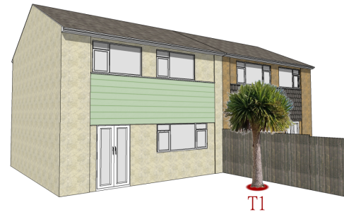
Rear view from West