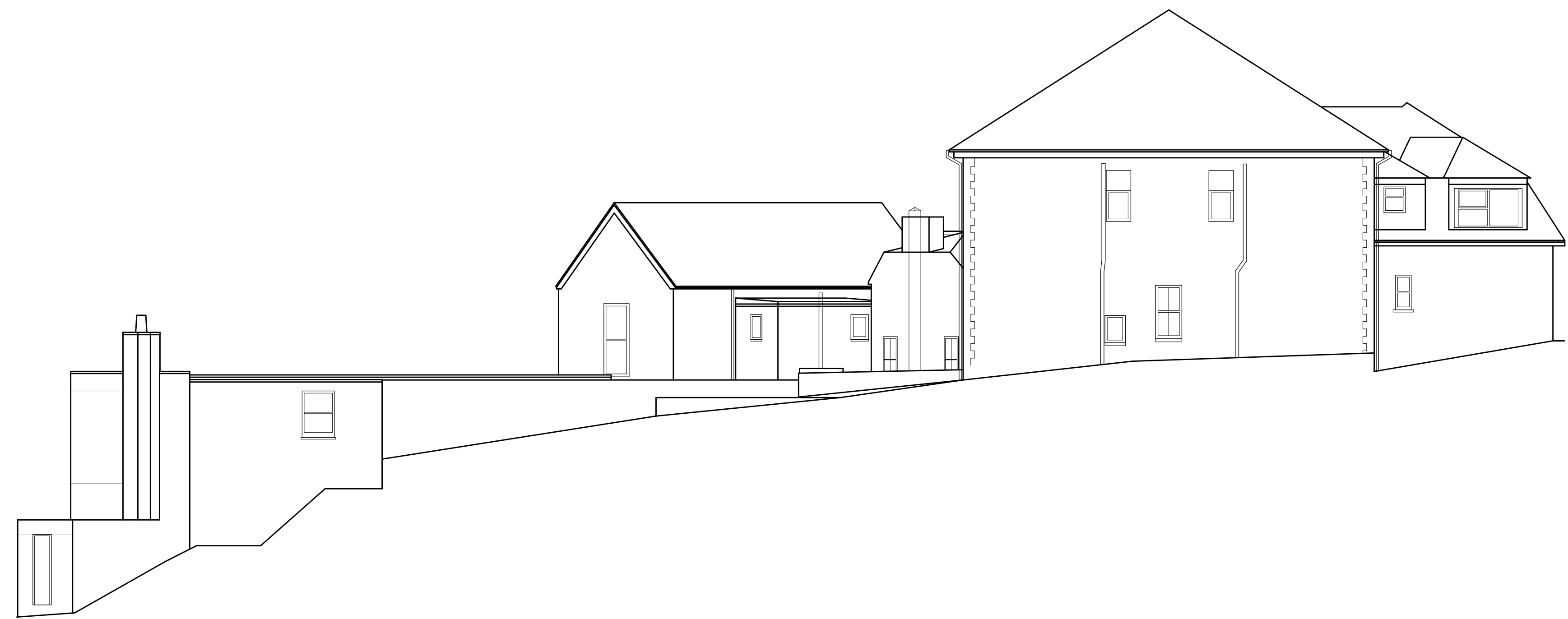
5.00m DATUM ELEVATION 8