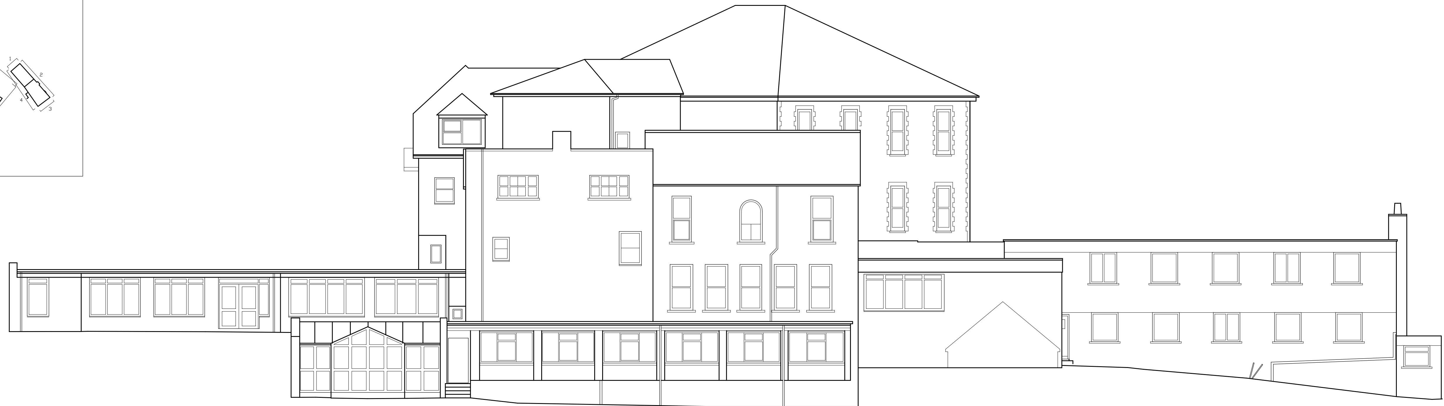
5.00m DATUM ELEVATION 6