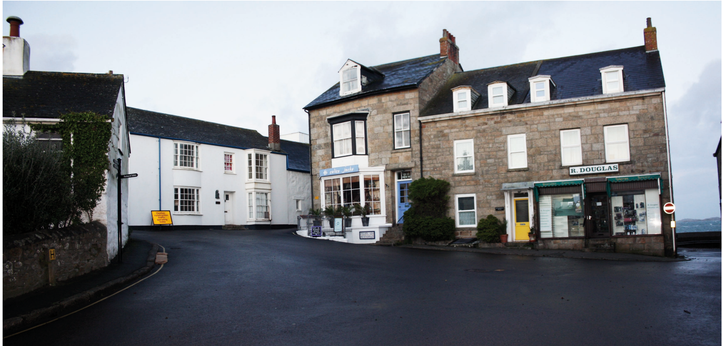
View Point 6 (11/11/15)