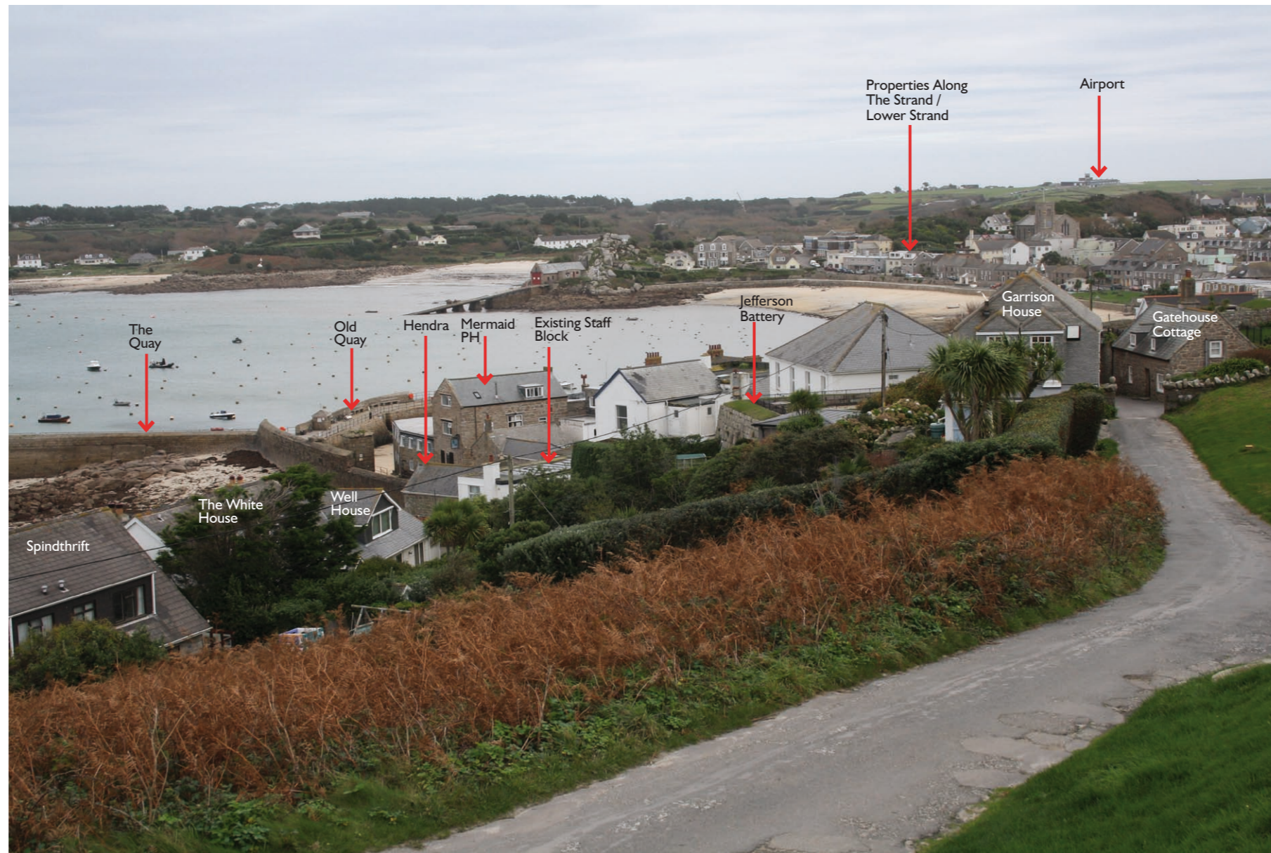
View Point 4 (11/11/15)