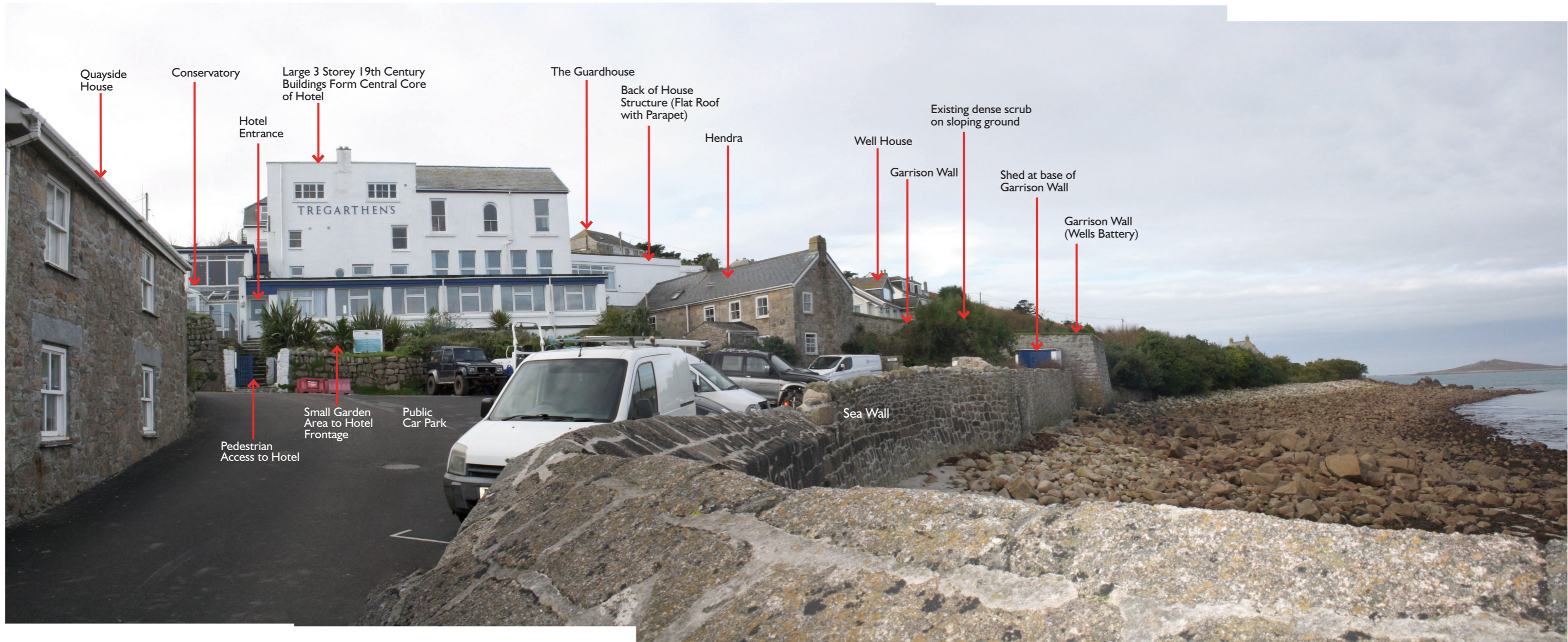
View Point 5 (11/11/15)

VIEW POINT NUMBER 5 View taken from The Quay looking west / south-west towards the Site.