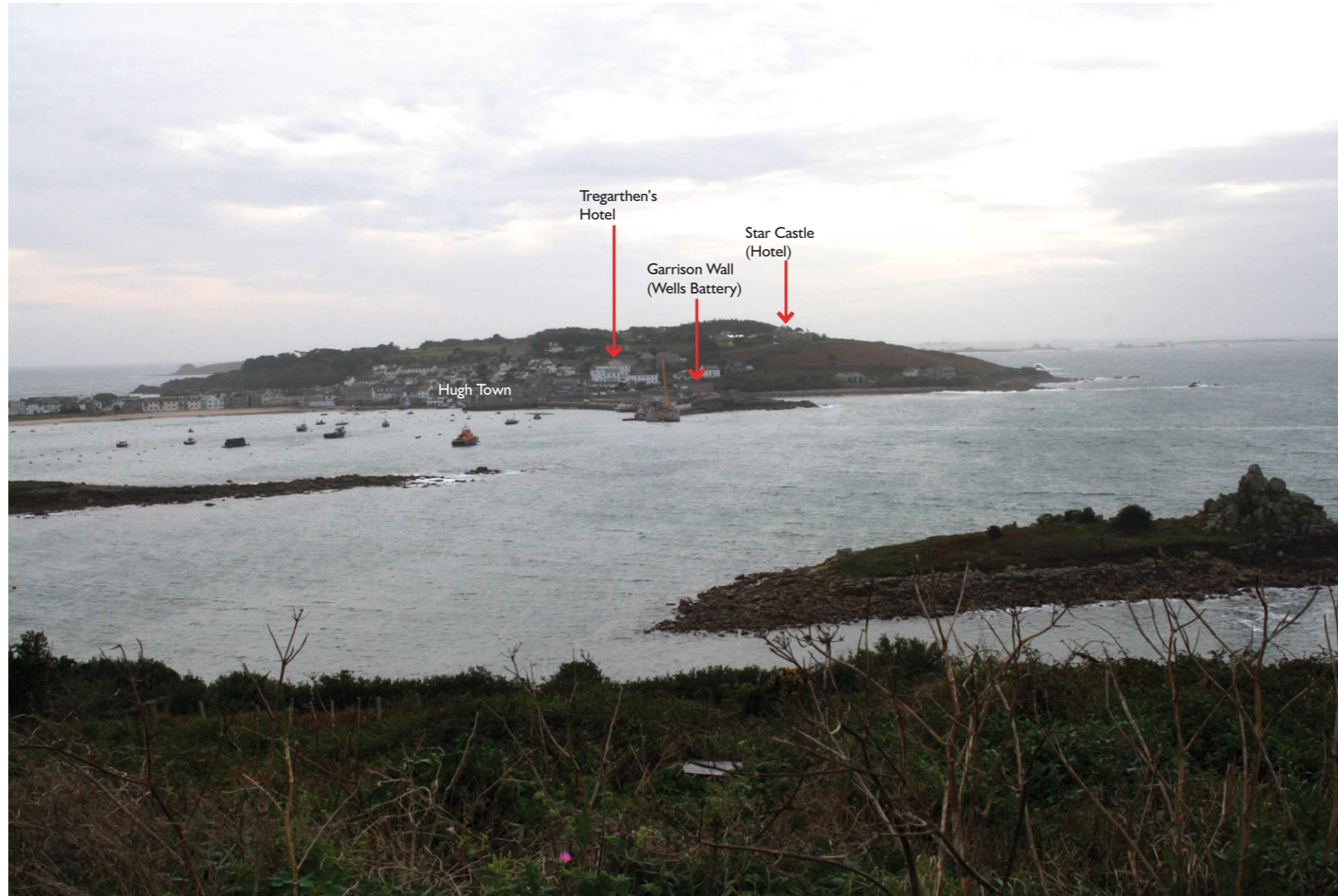
View Point 2 (11/11/15)