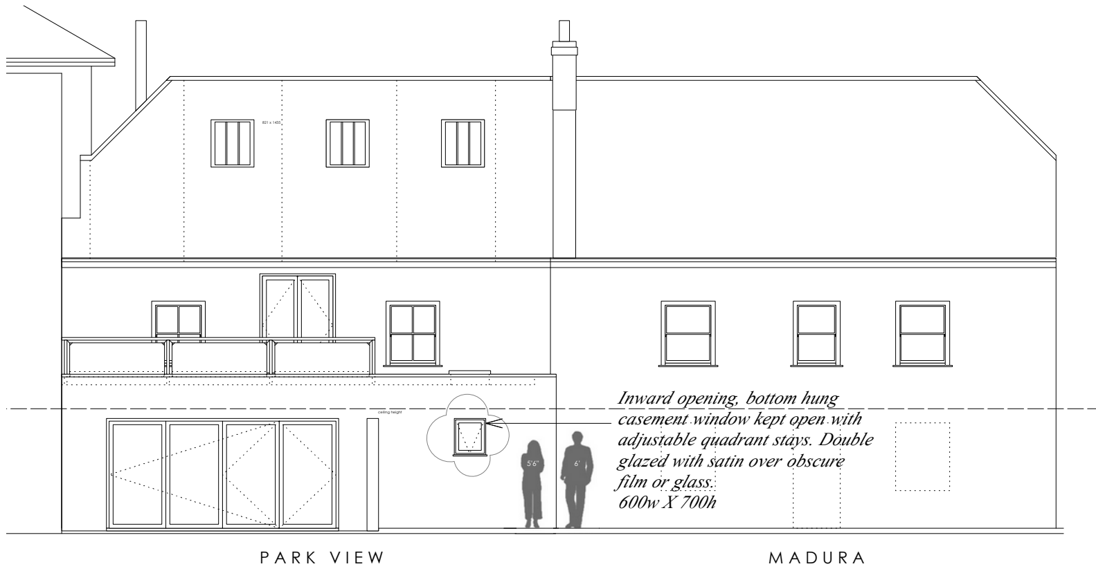
PARK VIEW MADURA PROPOSED REAR ELEVATION