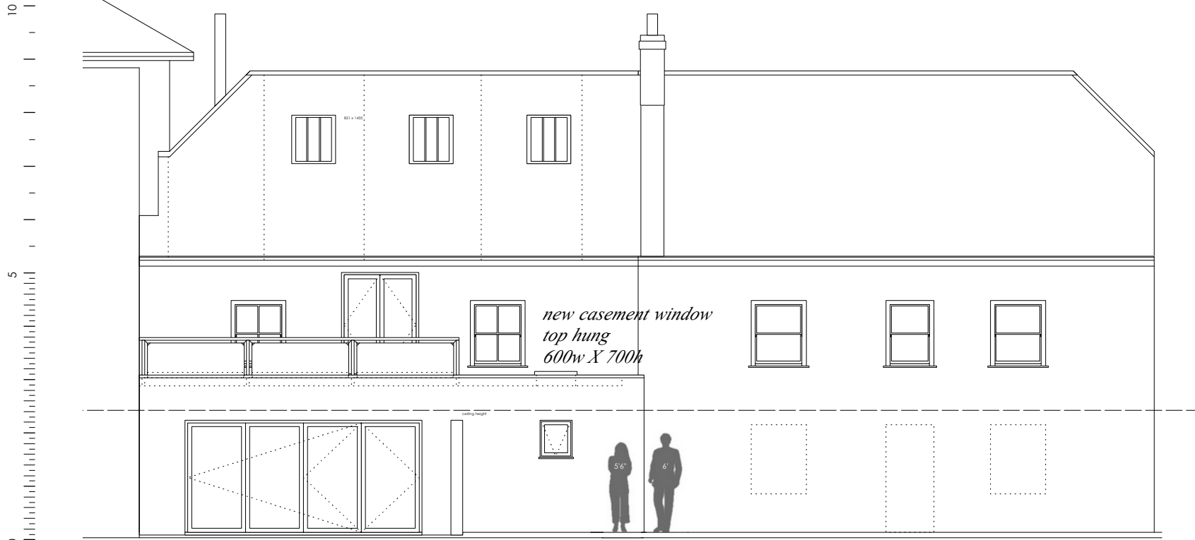
PARK VIEW MADURA