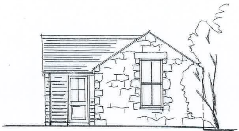
EXISTING S.W. ELEVATION