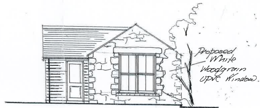
PROPOSED S.W. ELEVATION