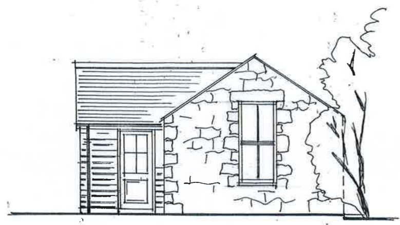
EXISTING S.W. ELEVATION