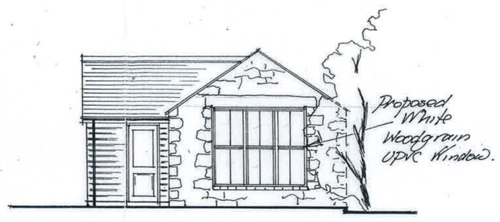
PROPOSED S.W. ELEVATION

RECEIVED BY THE PLANNING DEPARTMENT 20 JUL 2016