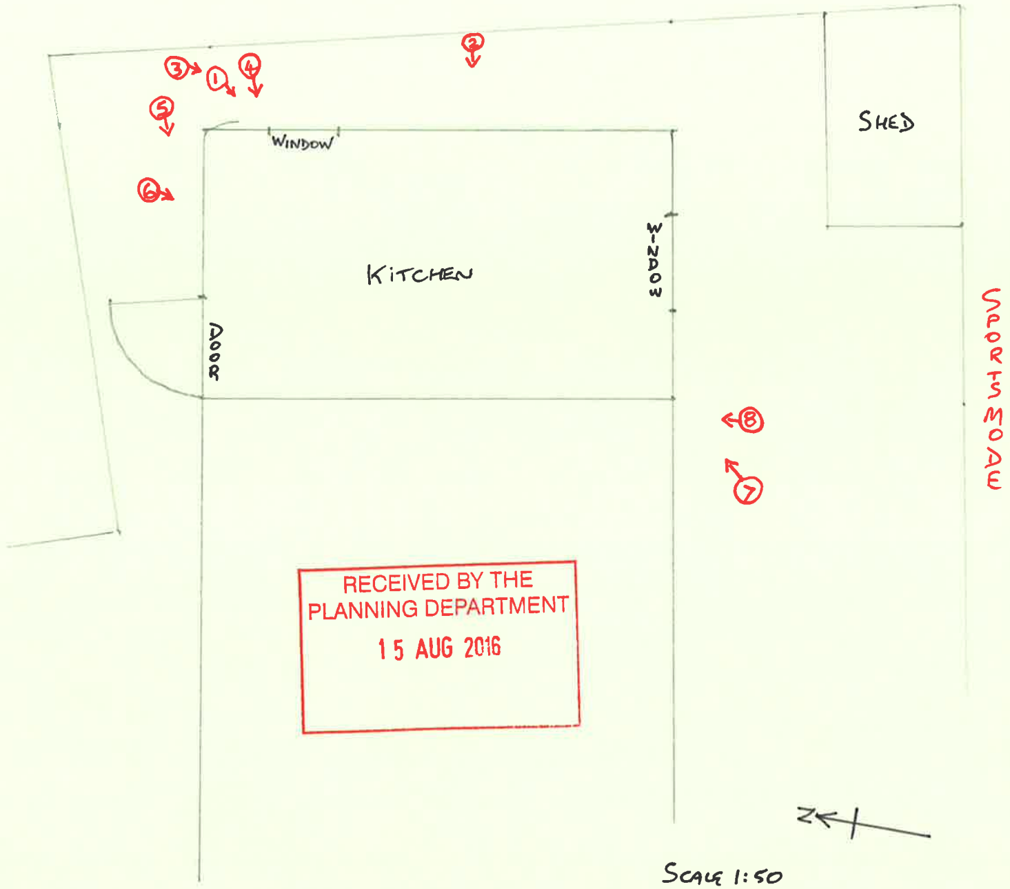
PLAN SHOWING POSITION AND DIRECTION OF ATTACHED PHOTOS