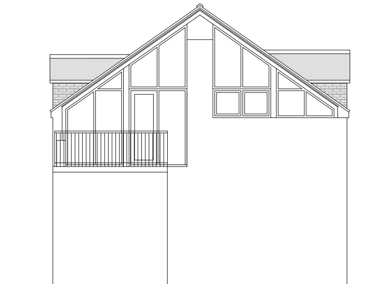
Side (South) Elevation