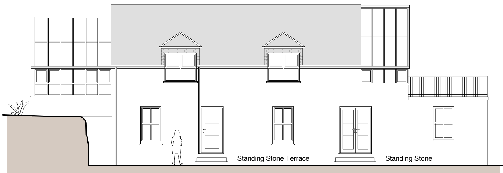
Front (West) Elevation