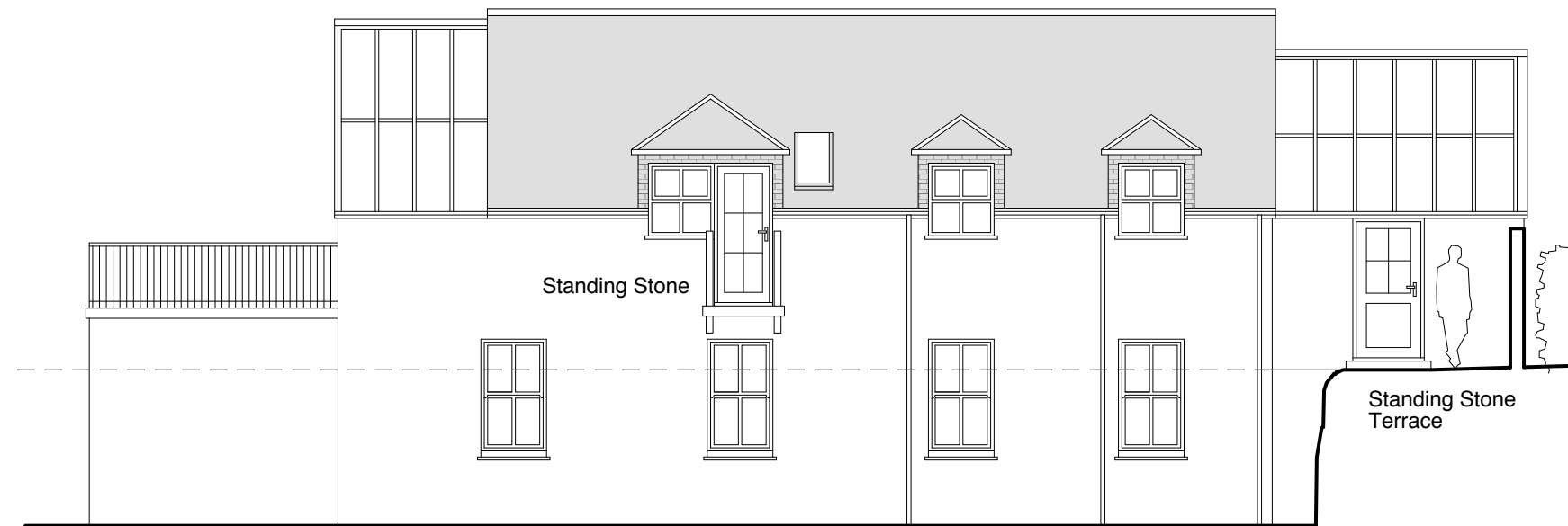
Rear (East) Elevation

Construction Materials: Roof: Natural dry-laid slate to main building. Safety glass to conservatories External walls: Masonry walls rendered and painted white Windows and doors: Softwood windows and doors stained dark brown Rainwater goods: White round section upvc Roof windows: 'Velux' centre-pivot roof windows