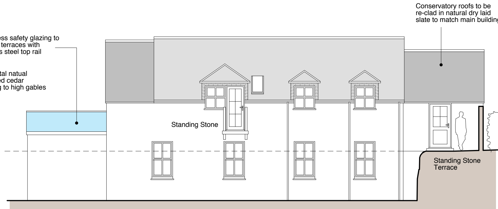
Rear (East) Elevation