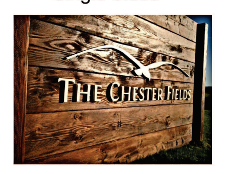
550x110mm slats Single Sided

CLOSED OPEN WEEKENDS 12noon - 4pm OPEN EVERY DAY 10.30am - 4.30pm