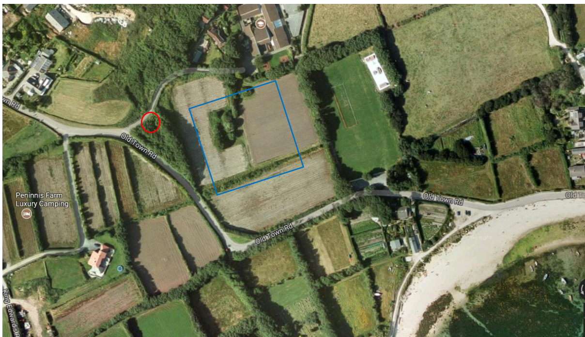
Photo 1 – Site Location, blue square indicates school location and red circle indicates tree location.

Careful consideration was given to the buildings location to ensure that minimal damage is being caused to more trees in the vicinity. The plan below shows the location of the tree being removed.