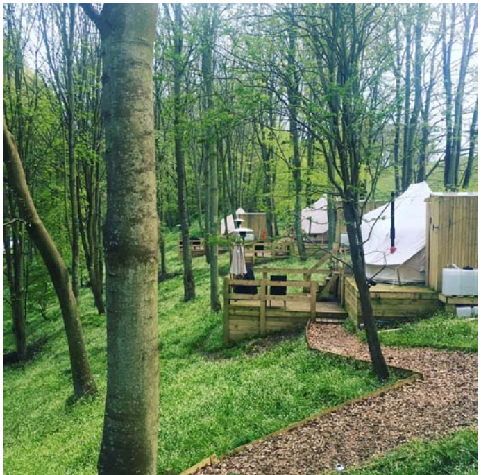
Group of tents in a well vegetated setting shown on raised decks