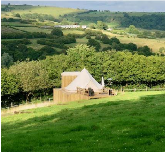
Tent shown on raised deck