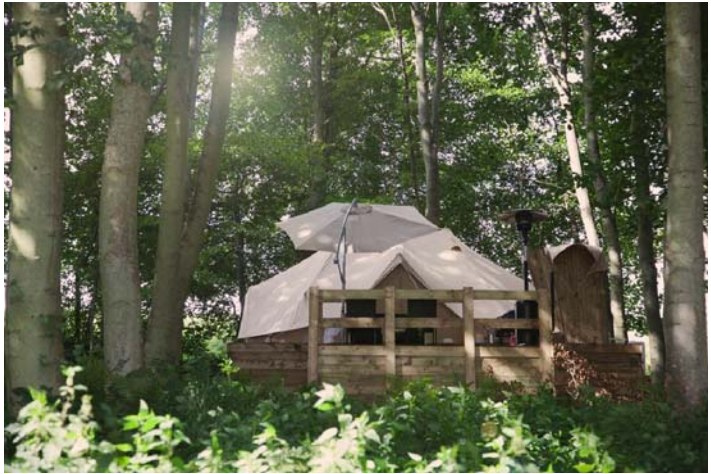
Typical tent including a raised deck and timber ballustrade