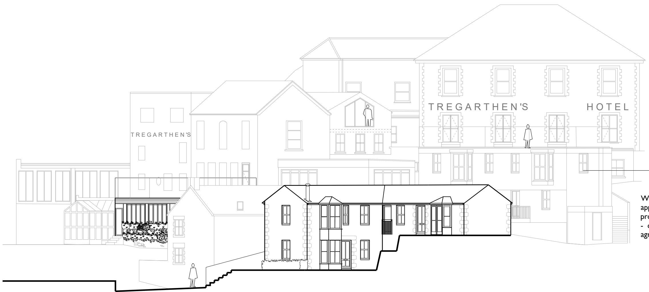
CONTEXT ELEVATION 2 1:200 @A3