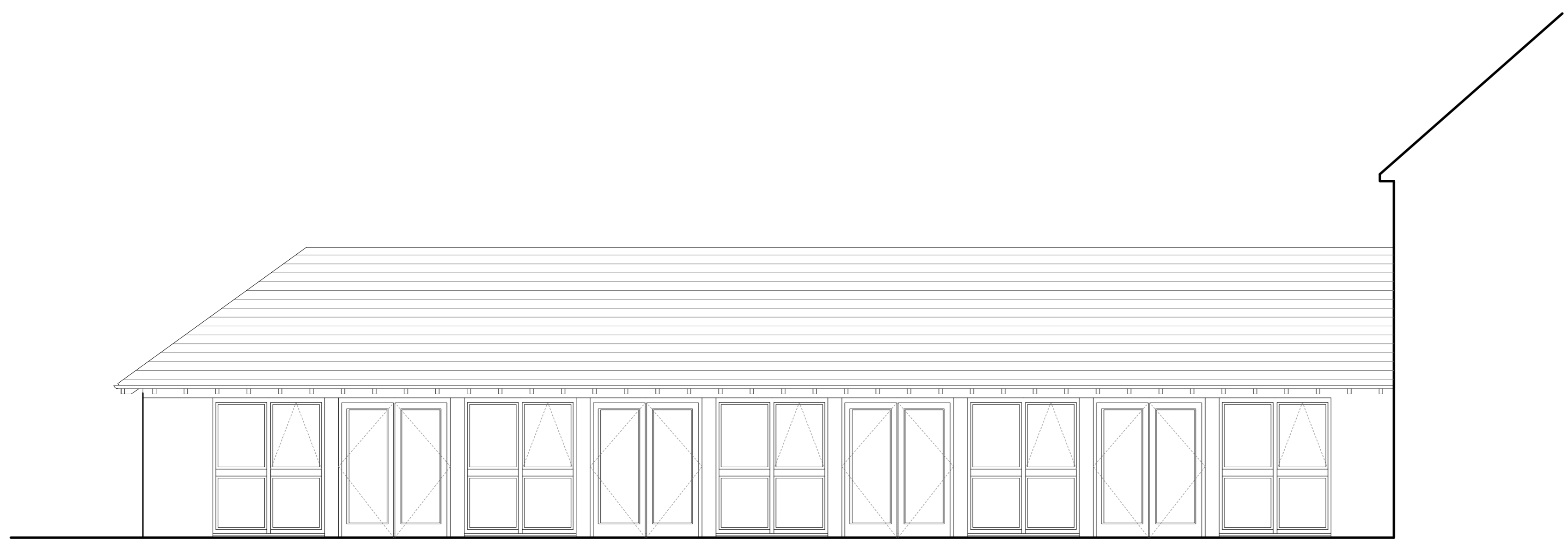
Existing South-East Elevation (no changes proposed) 1:50