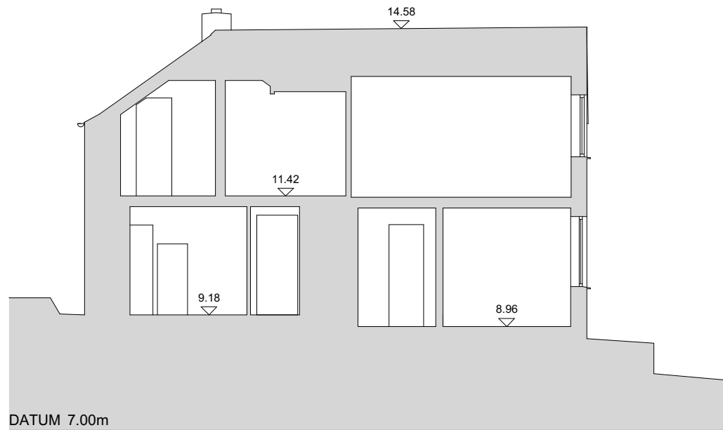
SECTION B - B