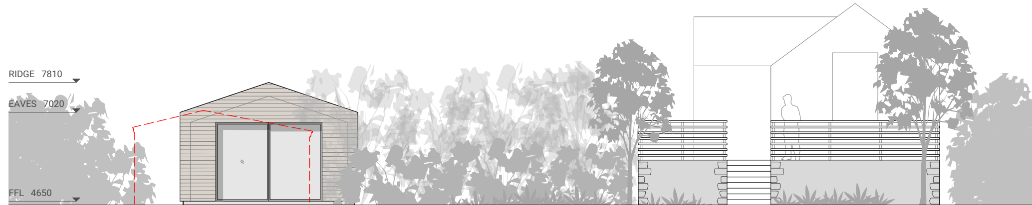
SOUTH WEST ELEVATION (facing shore)

Red dashed line - Indicates location of existing workshop