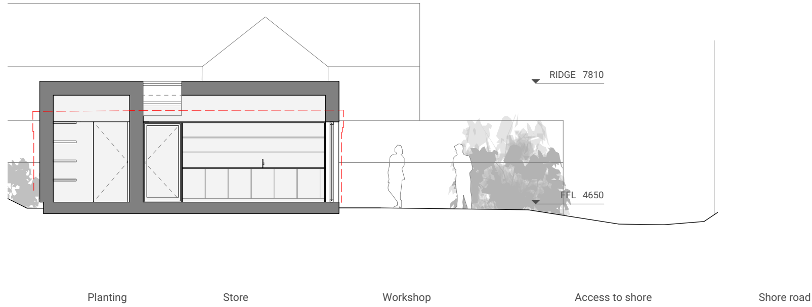
LONG SECTION AA (through workshop)

Red dashed line - Indicates location of existing workshop