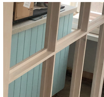
Proposed Window (Before Beading Attached)