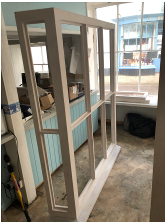
Proposed Window Frame