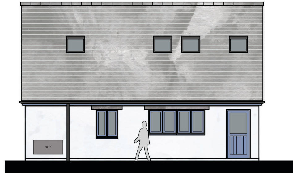
02 NORTH EAST ELEVATION