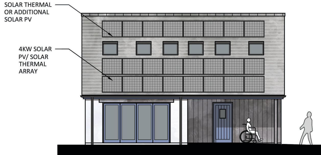
01 SOUTH WEST ELEVATION