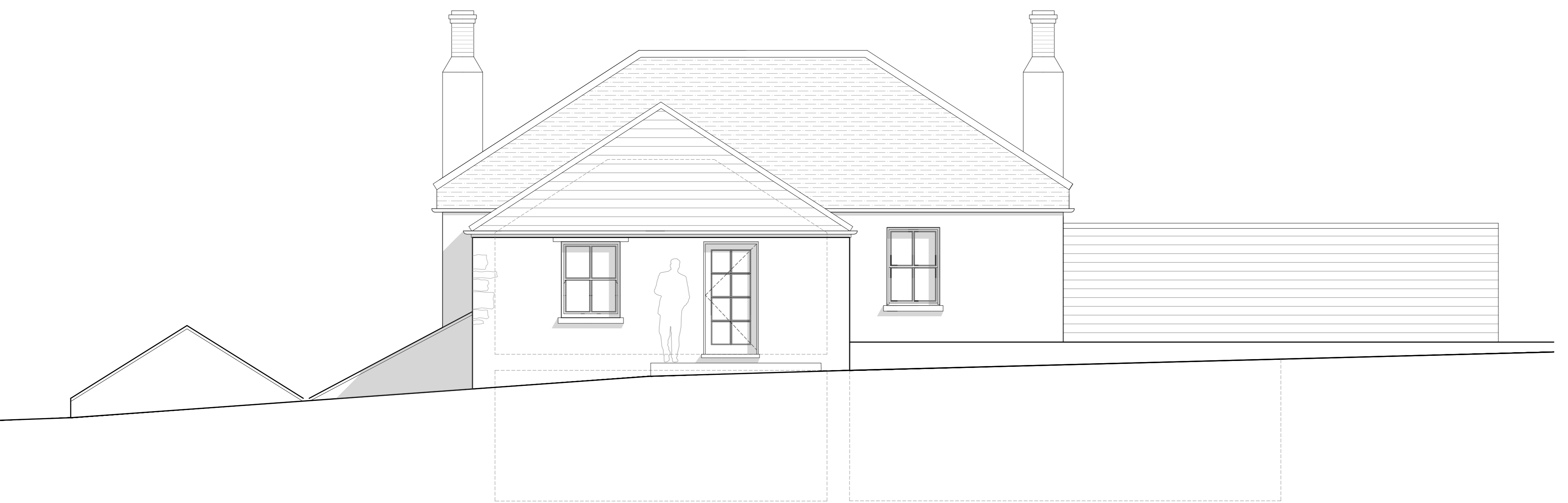
PROPOSED SOUTHWEST ELEVATION