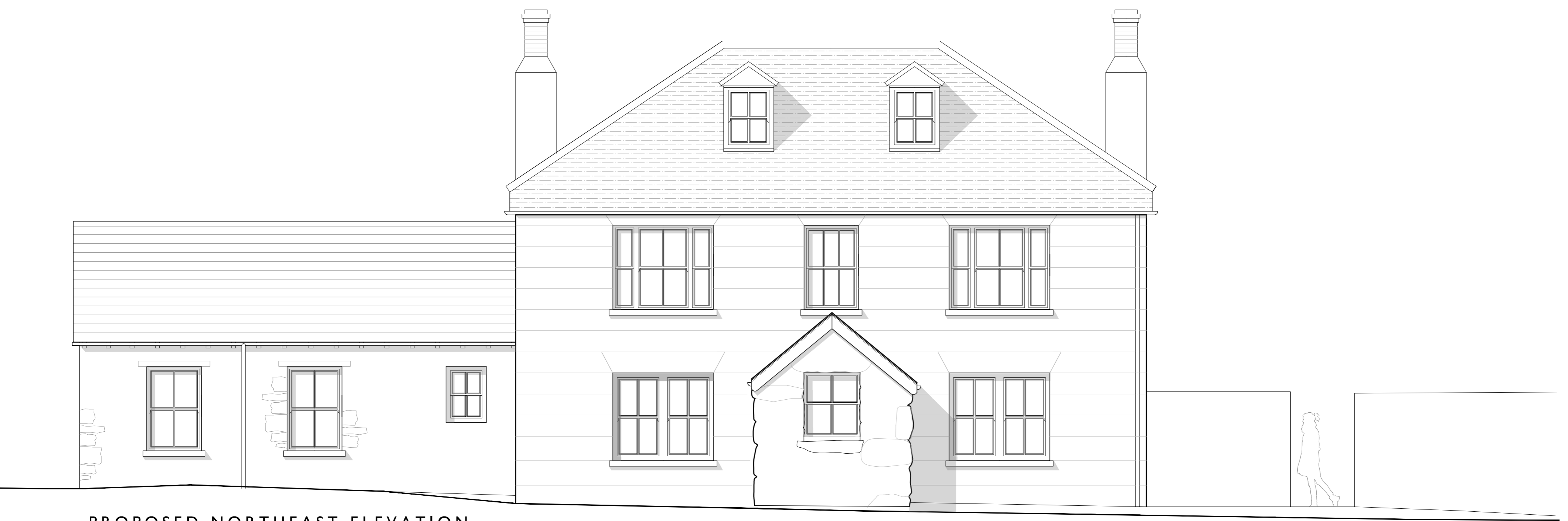
PROPOSED NORTHEAST ELEVATION

RECEIVED By A King at 11:02 am, Aug 20, 2020