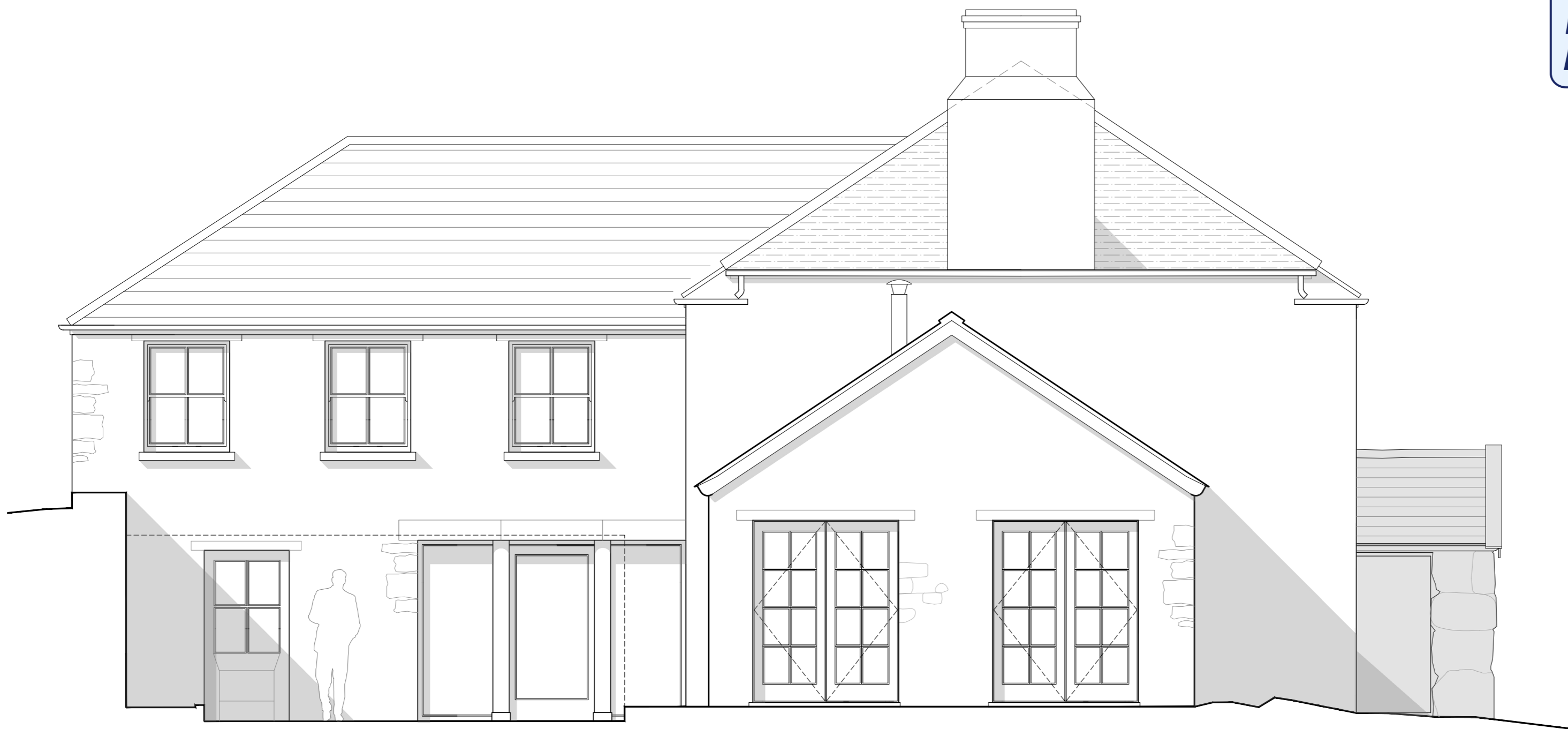
PROPOSED SOUTHEAST ELEVATION

RECEIVED By A King at 11:02 am, Aug 20, 2020