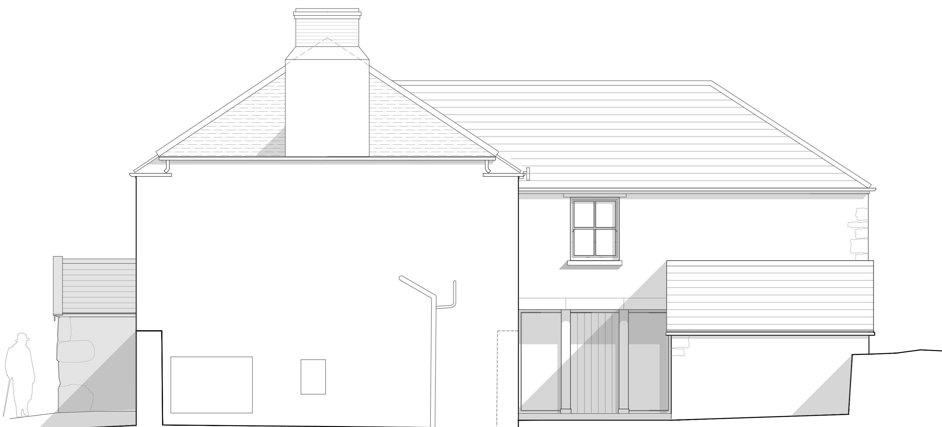
PROPOSED NORTHWEST ELEVATION