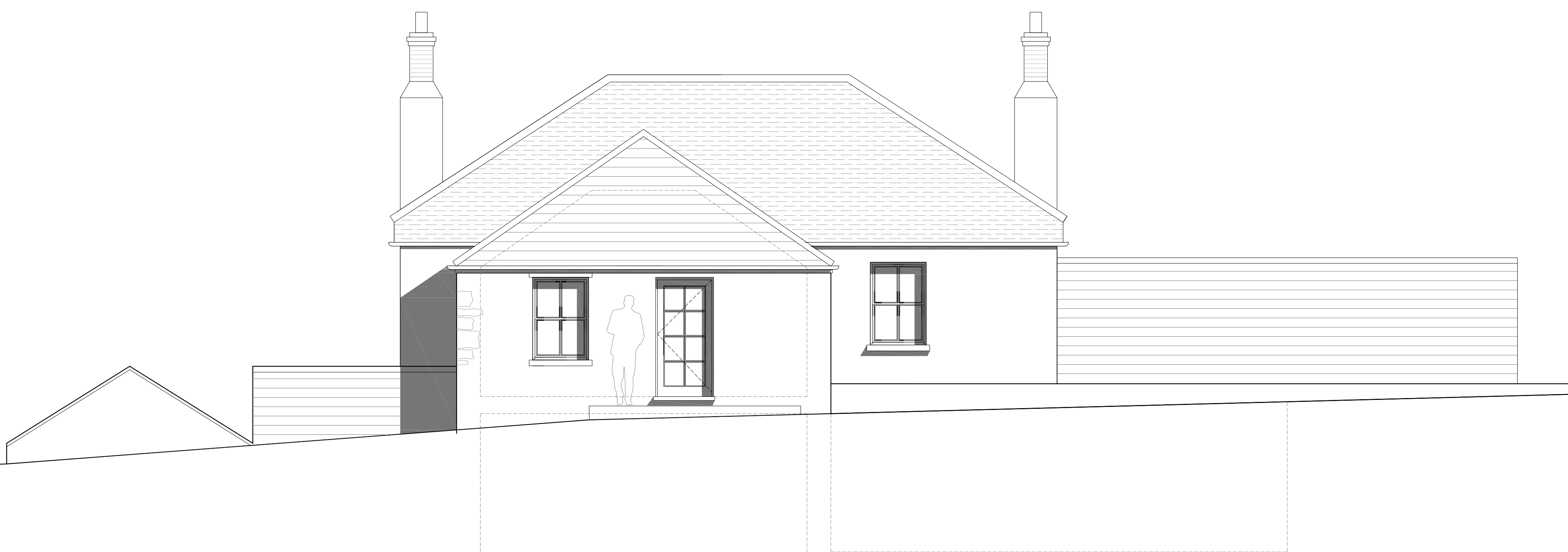
PROPOSED SOUTHWEST ELEVATION