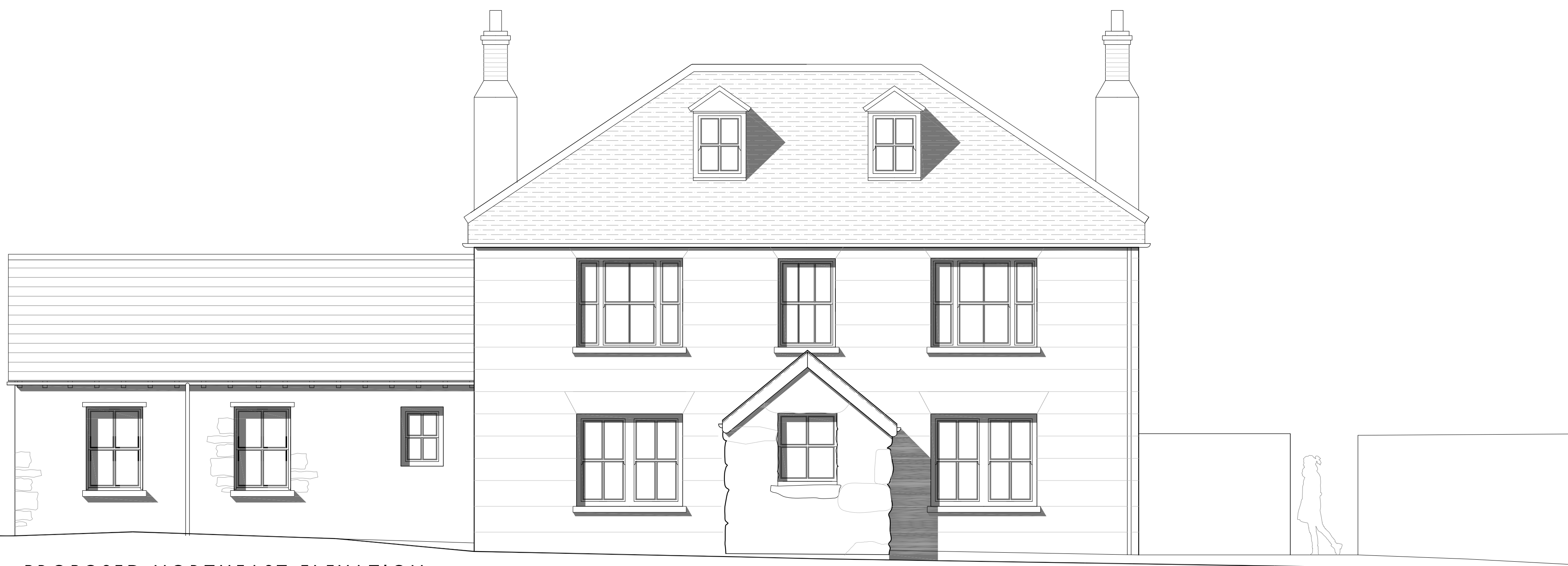
PROPOSED NORTHEAST ELEVATION