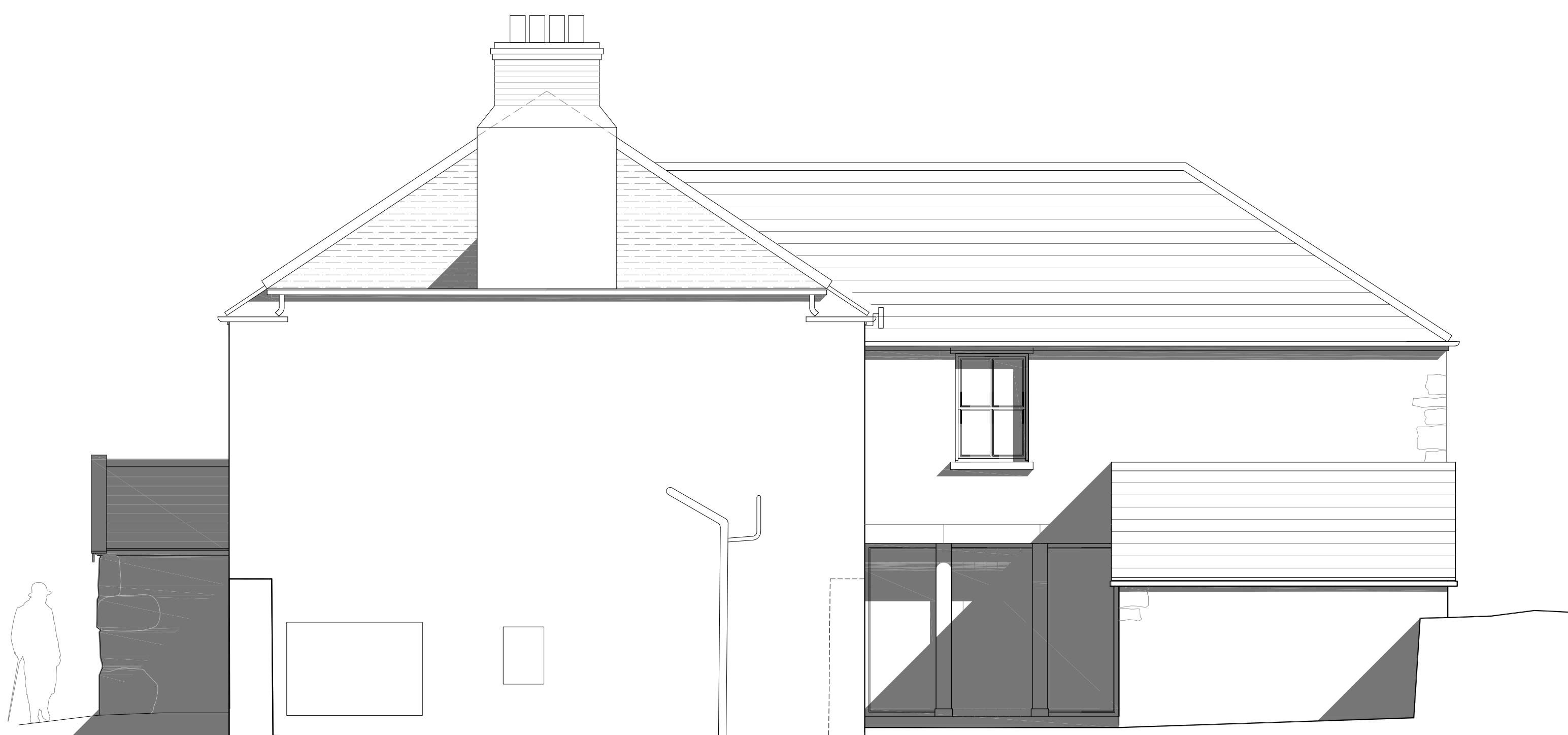
PROPOSED NORTHWEST ELEVATION