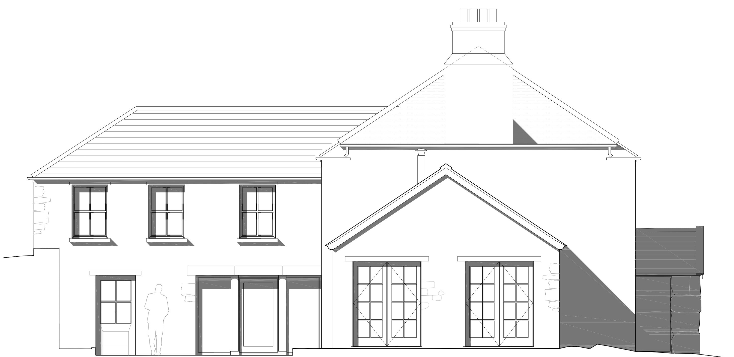
PROPOSED SOUTHEAST ELEVATION