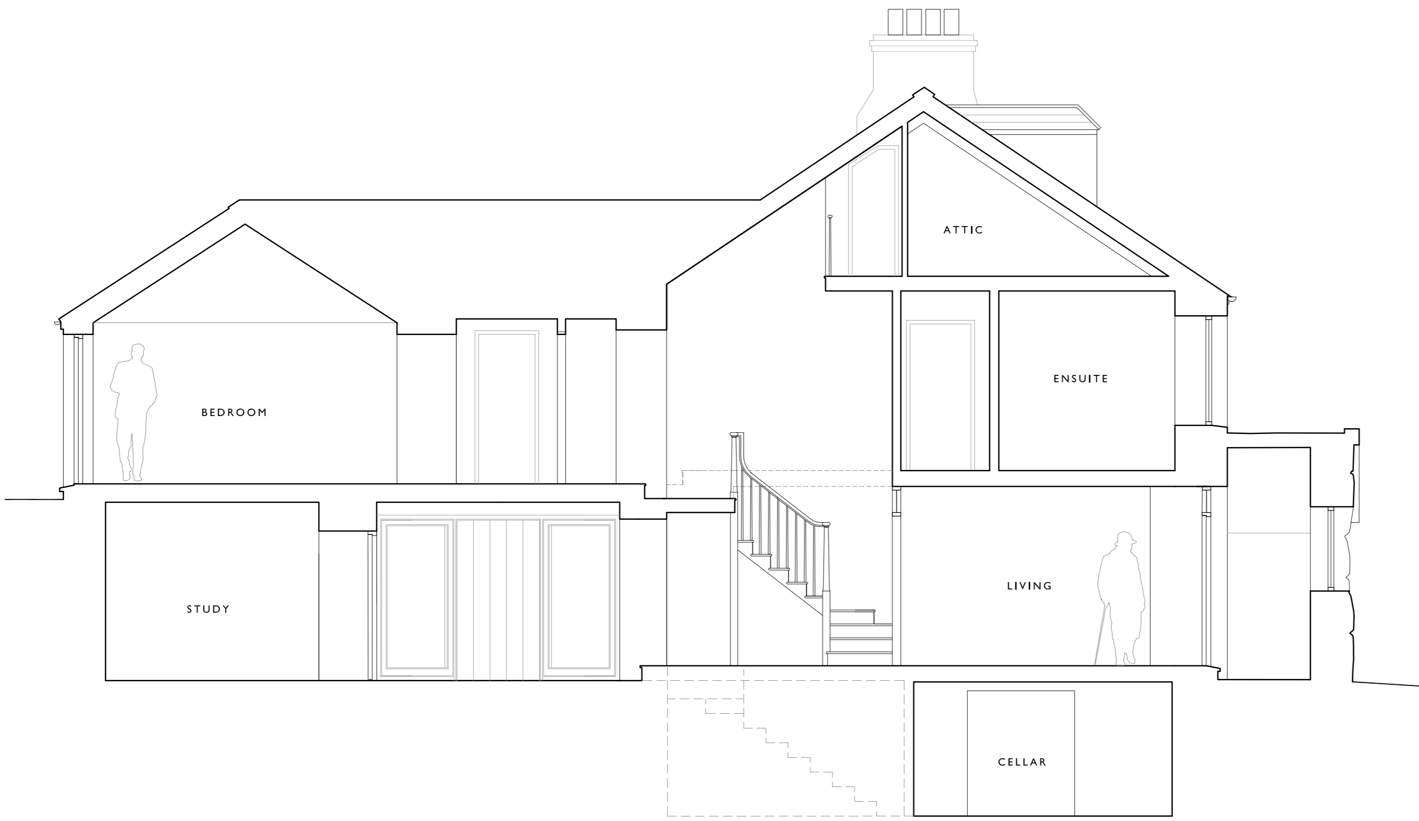
PROPOSED SECTION A-A