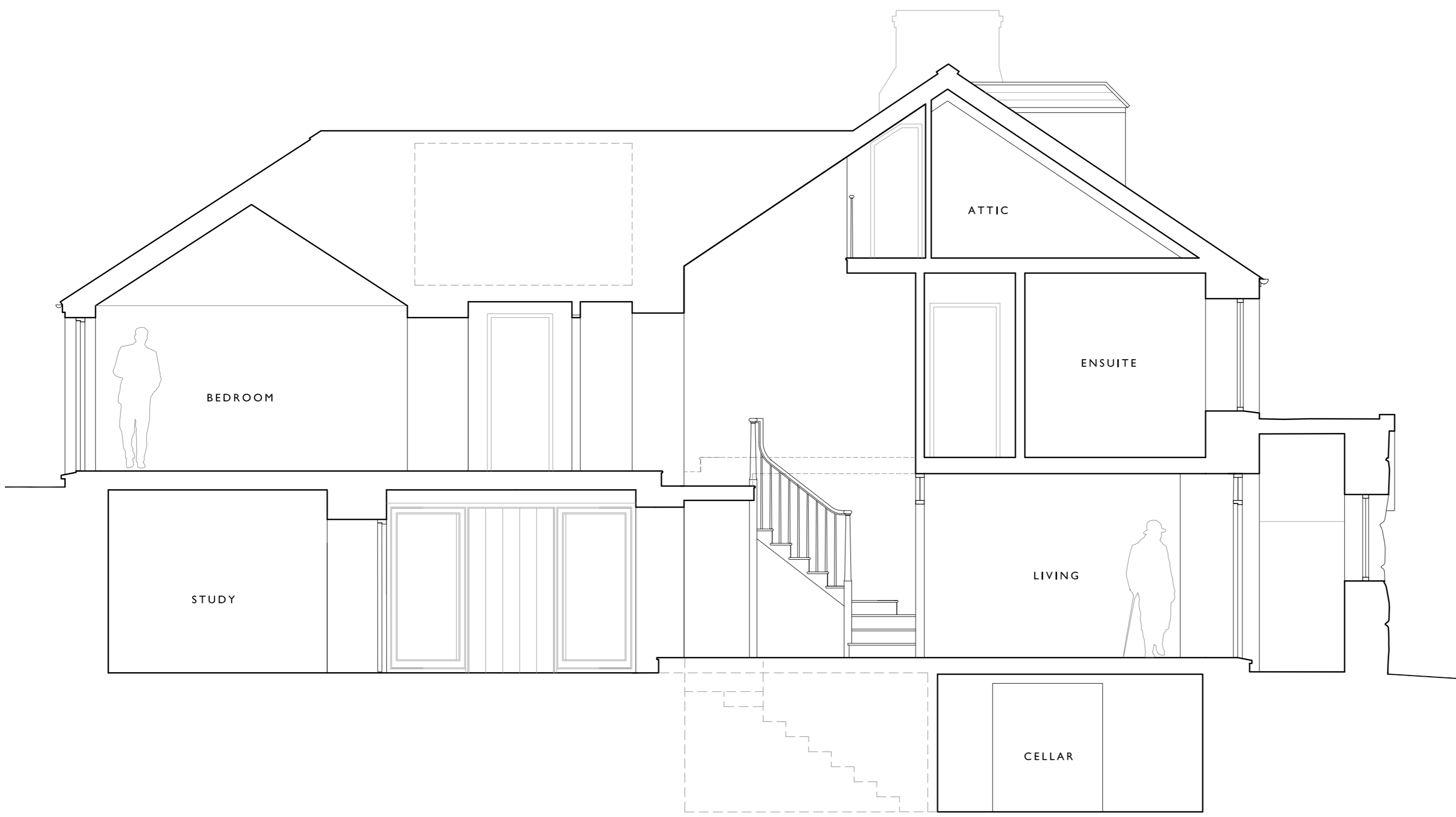
PROPOSED SECTION A-A