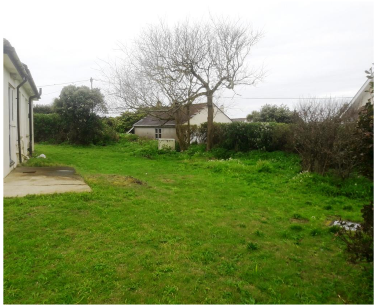
Photo 3. Expanse of improved grassland and Dutch Elm in background

half of the garden (see photos 2 and 4.). As a result the ground flora is dominated by Red Campion ( Silene dioica ), Hogweed ( Heracleum sphondylium ), Common Nettle ( Urtica dioica ) and Scarlet Pimpernel ( Anagallis arvensis ). Immediately to the south-west a small patch of Sheep's-sorrel ( Rumex acetosella ), Cleavers ( Galium aparine ), Common Cat's-ear ( Hypochaeris radicata ) and Procumbent Pearlwort ( Sagina procumbens ) suggest more acid conditions, likely due to a previous fire site. Under all the hedgerows the ground flora is dominated by the non-native invasive Three-cornered Leek ( Allium triquetum ) and Monbretia ( Crocasmia x corocosmiliflora ), which are also found scattered throughout the area of disturbed ground to the north and west of the site.