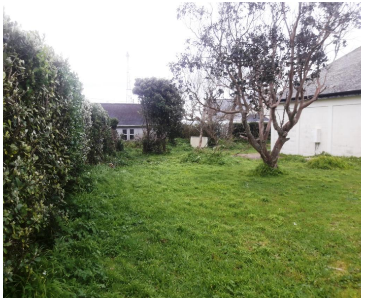
Photo 4 Disturbed grassland with Pittosporum hedge and Eucalyptus tree

half of the garden (see photos 2 and 4.). As a result the ground flora is dominated by Red Campion ( Silene dioica ), Hogweed ( Heracleum sphondylium ), Common Nettle ( Urtica dioica ) and Scarlet Pimpernel ( Anagallis arvensis ). Immediately to the south-west a small patch of Sheep's-sorrel ( Rumex acetosella ), Cleavers ( Galium aparine ), Common Cat's-ear ( Hypochaeris radicata ) and Procumbent Pearlwort ( Sagina procumbens ) suggest more acid conditions, likely due to a previous fire site. Under all the hedgerows the ground flora is dominated by the non-native invasive Three-cornered Leek ( Allium triquetum ) and Monbretia ( Crocasmia x corocosmiliflora ), which are also found scattered throughout the area of disturbed ground to the north and west of the site.