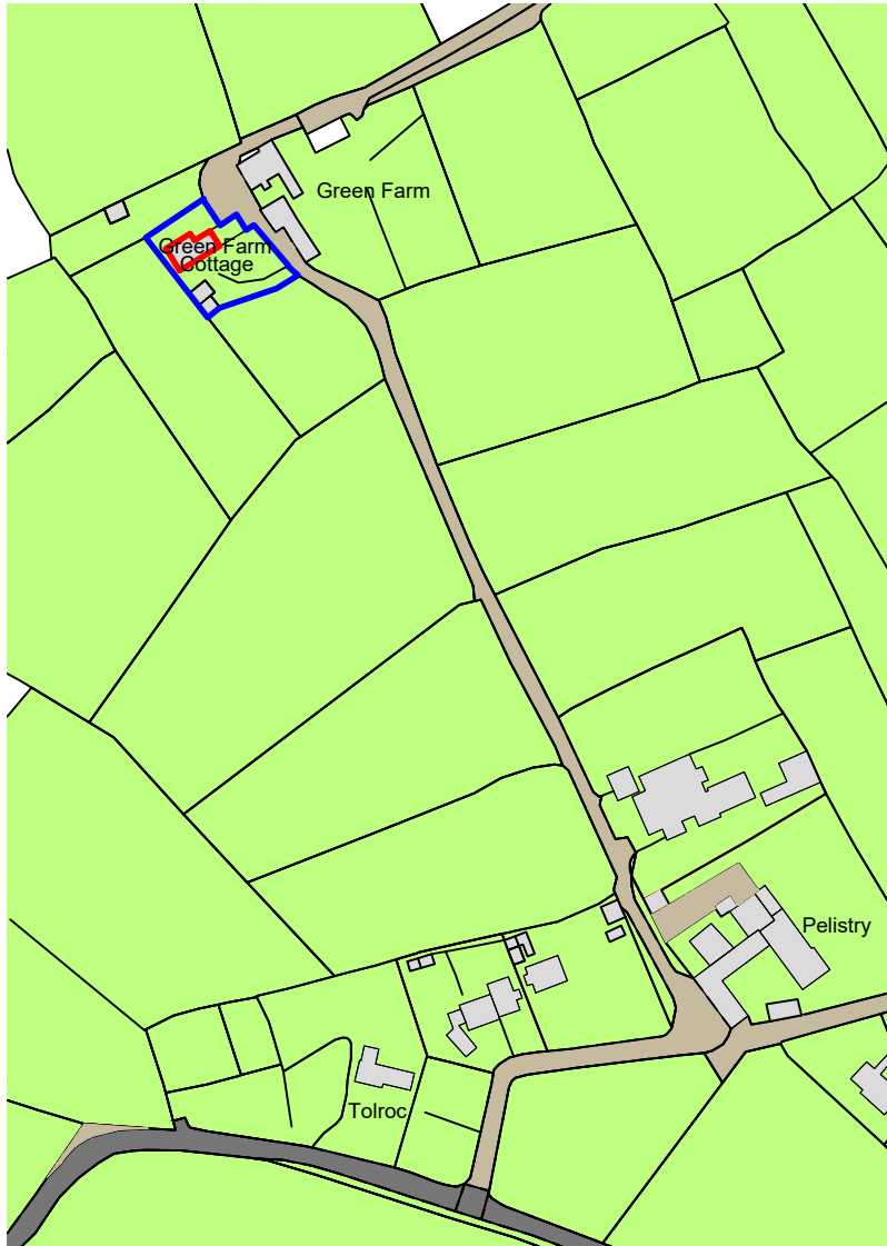
LOCATION PLAN 1:2500

RECEIVED By Tom Anderton at 2:42 pm, Jan 05, 2021