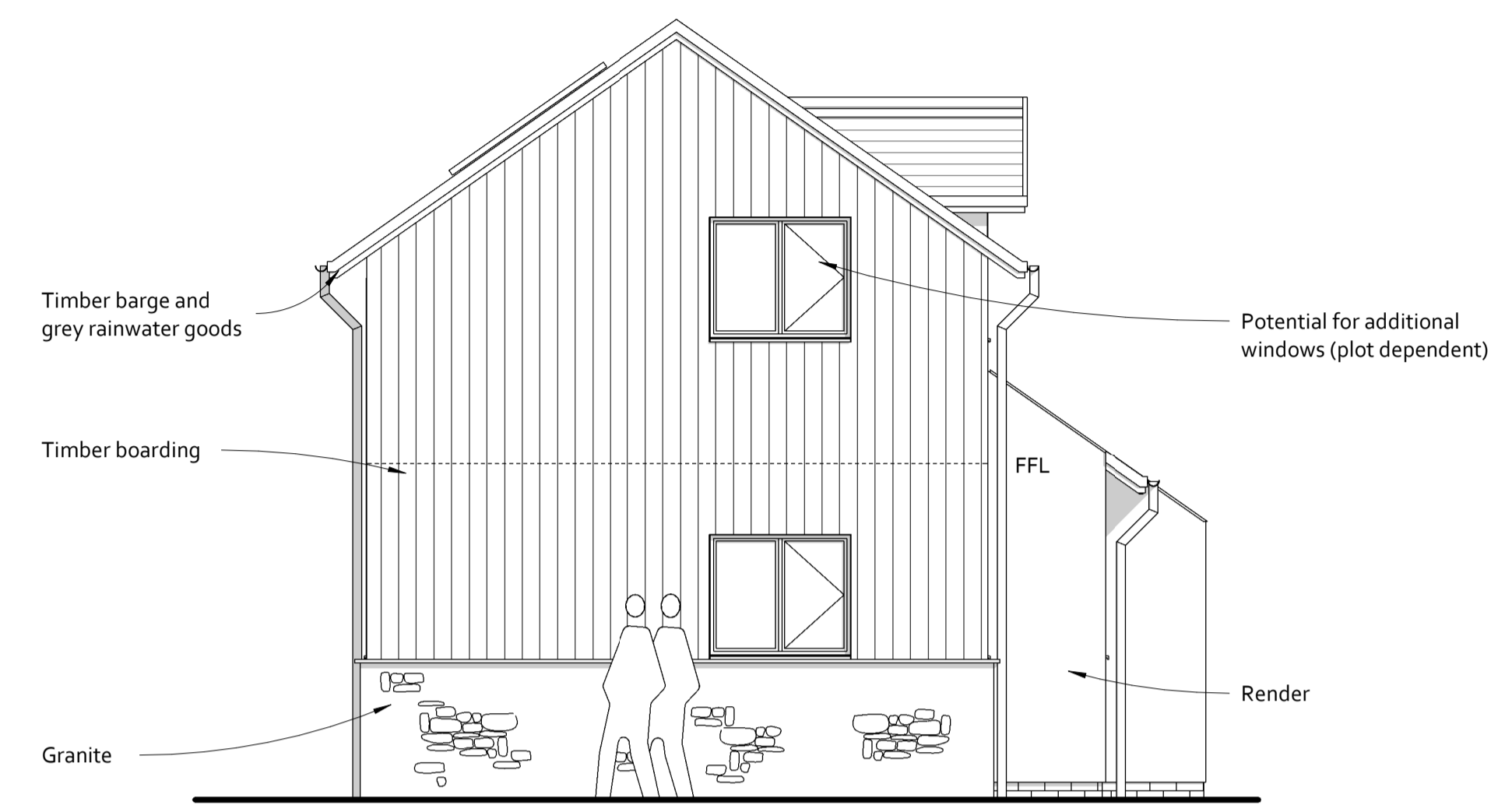
Side Elevation A 1 : 50