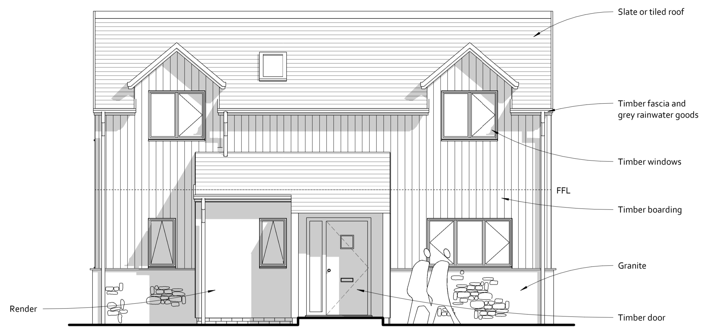
Front Elevation 1 : 50