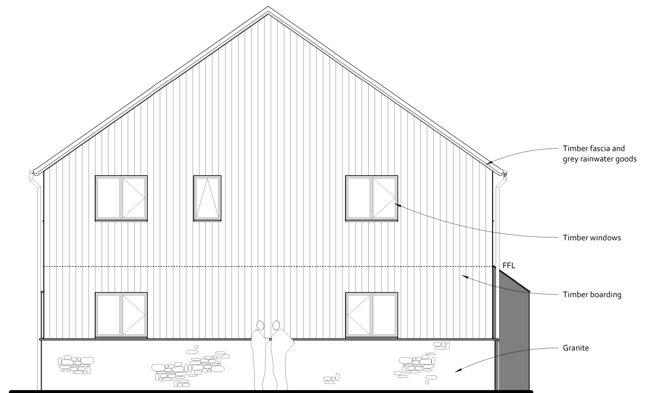
Side Elevation B