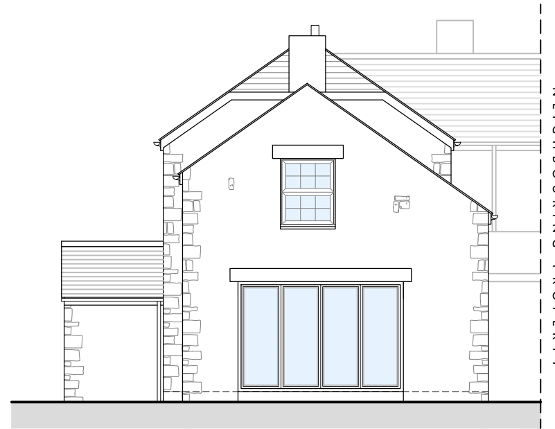
SIDE ELEVATION - scale 1/100 (PROPOSED)