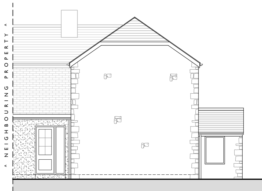
SIDE ELEVATION - scale 1/100 (AS EXISTING)