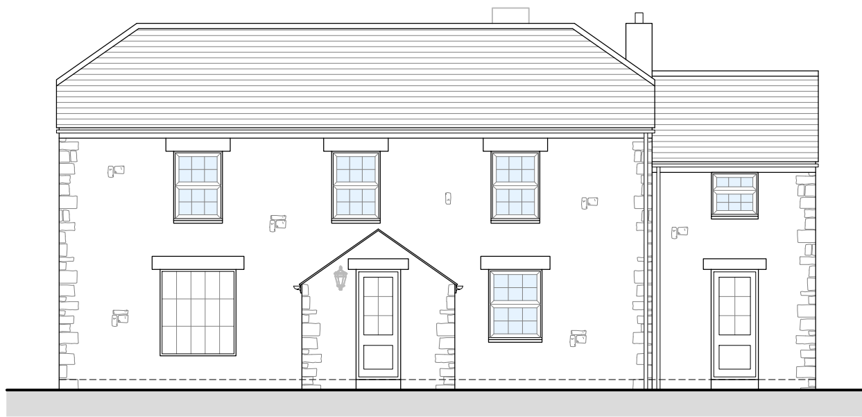
FRONT ELEVATION - scale 1/100 (PROPOSED)

RECEIVED By A King at 6:05 pm, Nov 17, 2021