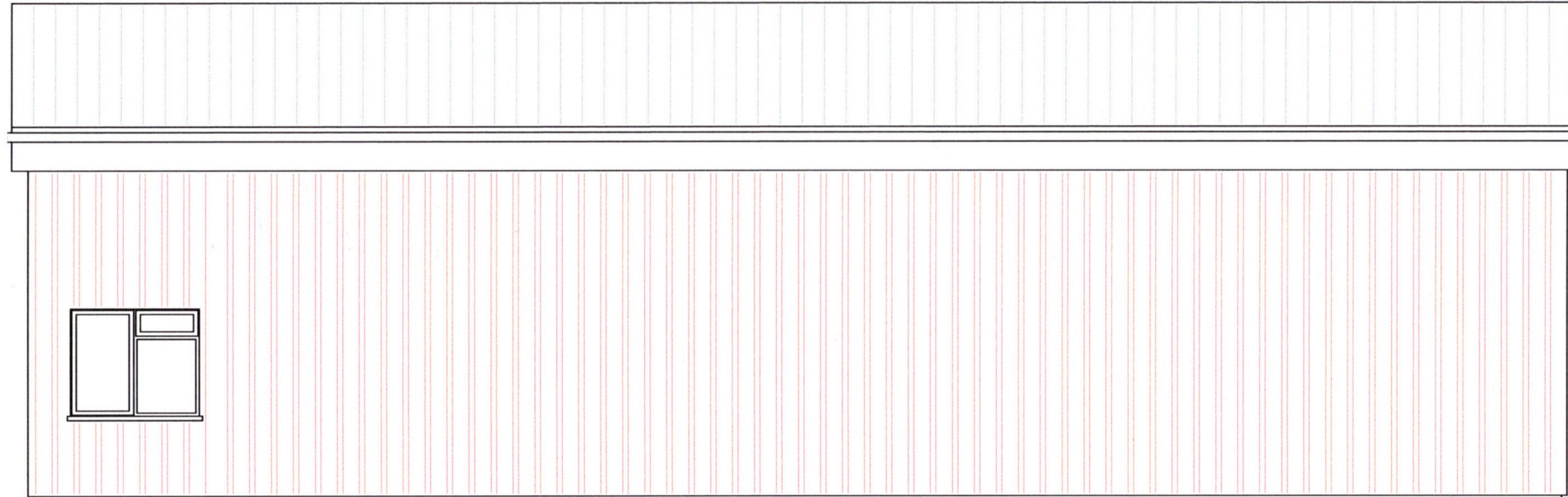
Existing South Elevation

CONTRACTORS MUST CHECK ALL DIMENSIONS ON SITE. ONLY FIGURED DIMENSIONS ARE TO BE WORKED FROM. DISCREPANCIES MUST BE REPORTED IMMEDIATELY TO THE ENGINEER BEFORE PROCEEDING. PRELIMINARY DRAWINGS MUST NOT BE USED FOR CONSTRUCTION PURPOSES. ALL DIMENSIONS IN mm UON