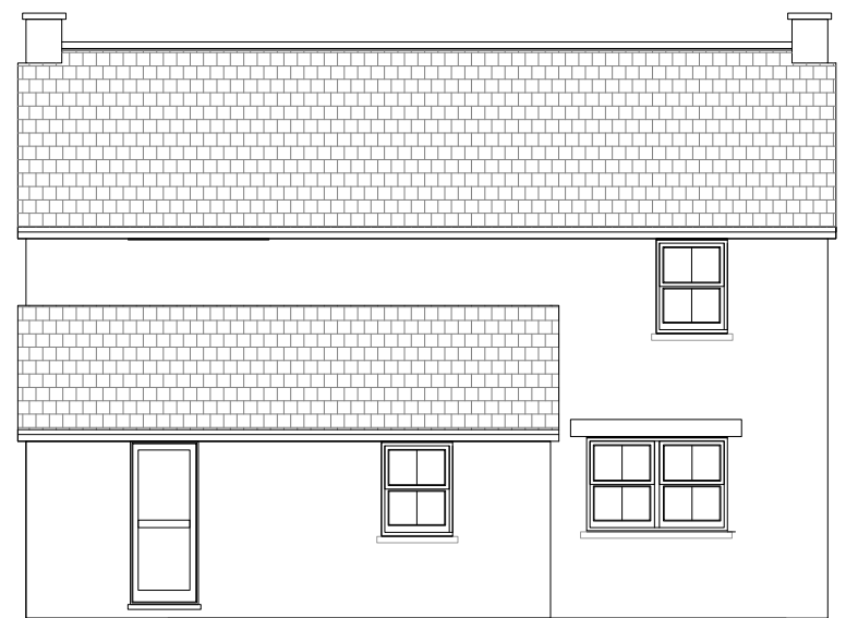
Rear Elevation North-East

H A Planning 67 Cleevemount Road Cheltenham Gloucestershire GL52 3HD 07500 555495