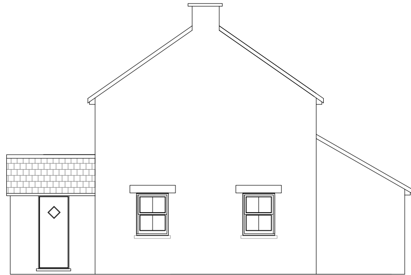
Side Elevation South-East