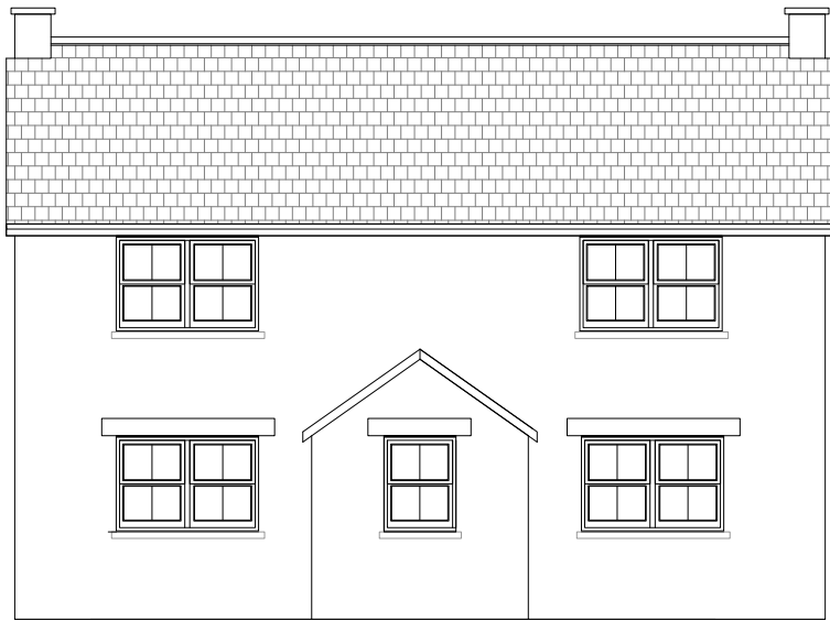
Front Elevation West-South