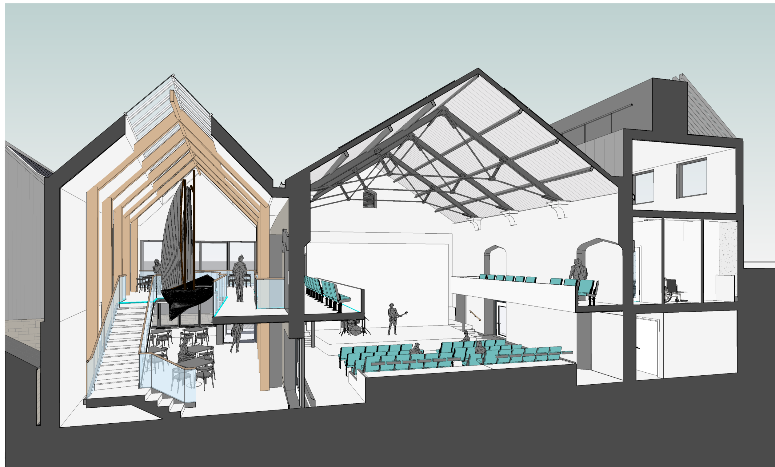
4 Scheme Cutaway

Notes: Drawings are based on survey data and may not accurately represent what is physically present. Do not scale from this drawing. All dimensions are to be verified on site before proceeding with the work. All dimensions are in millimeters unless noted otherwise. Purcell shall be notified in writing of any discrepancies.