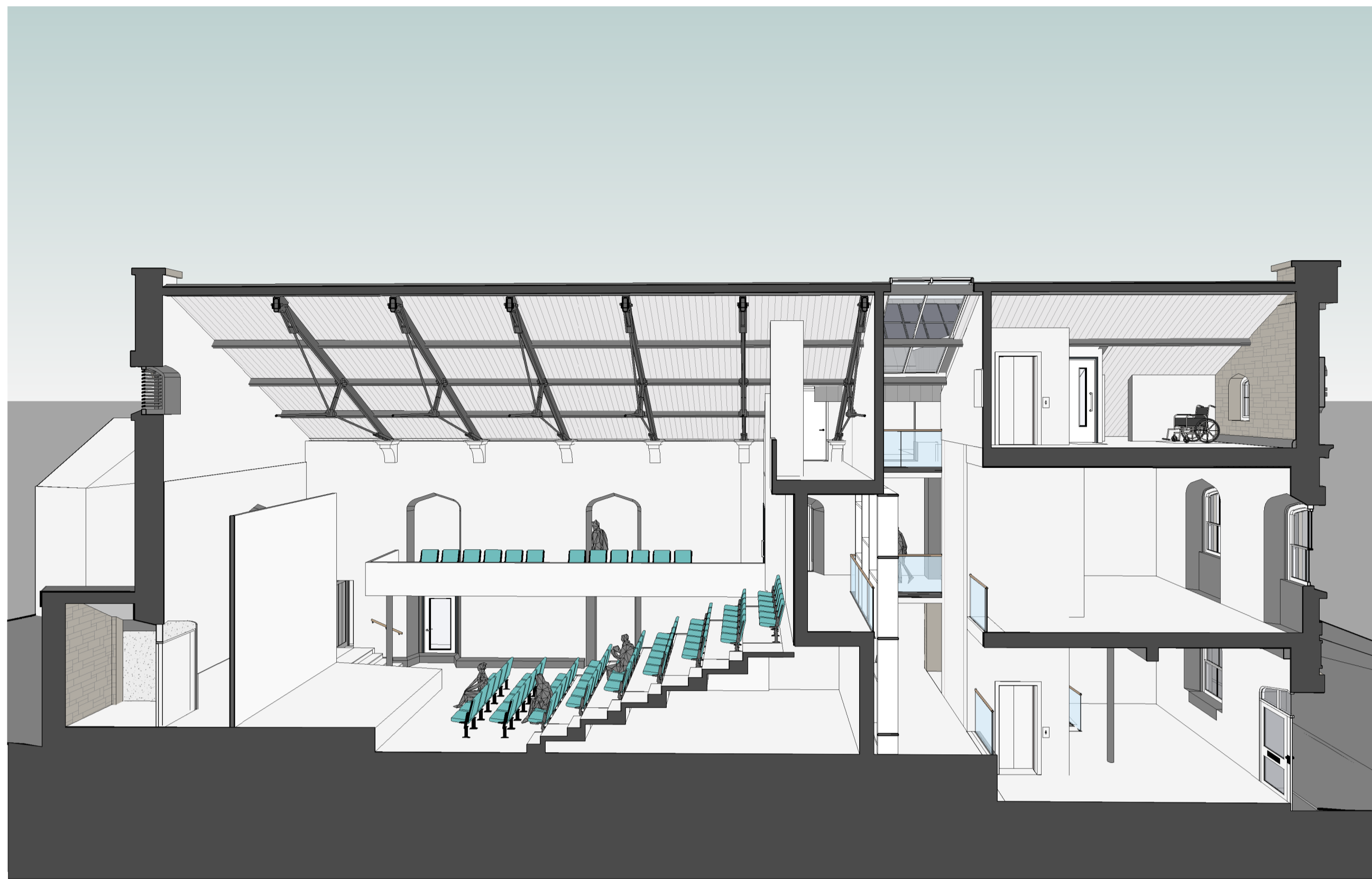
2 Town Hall Section