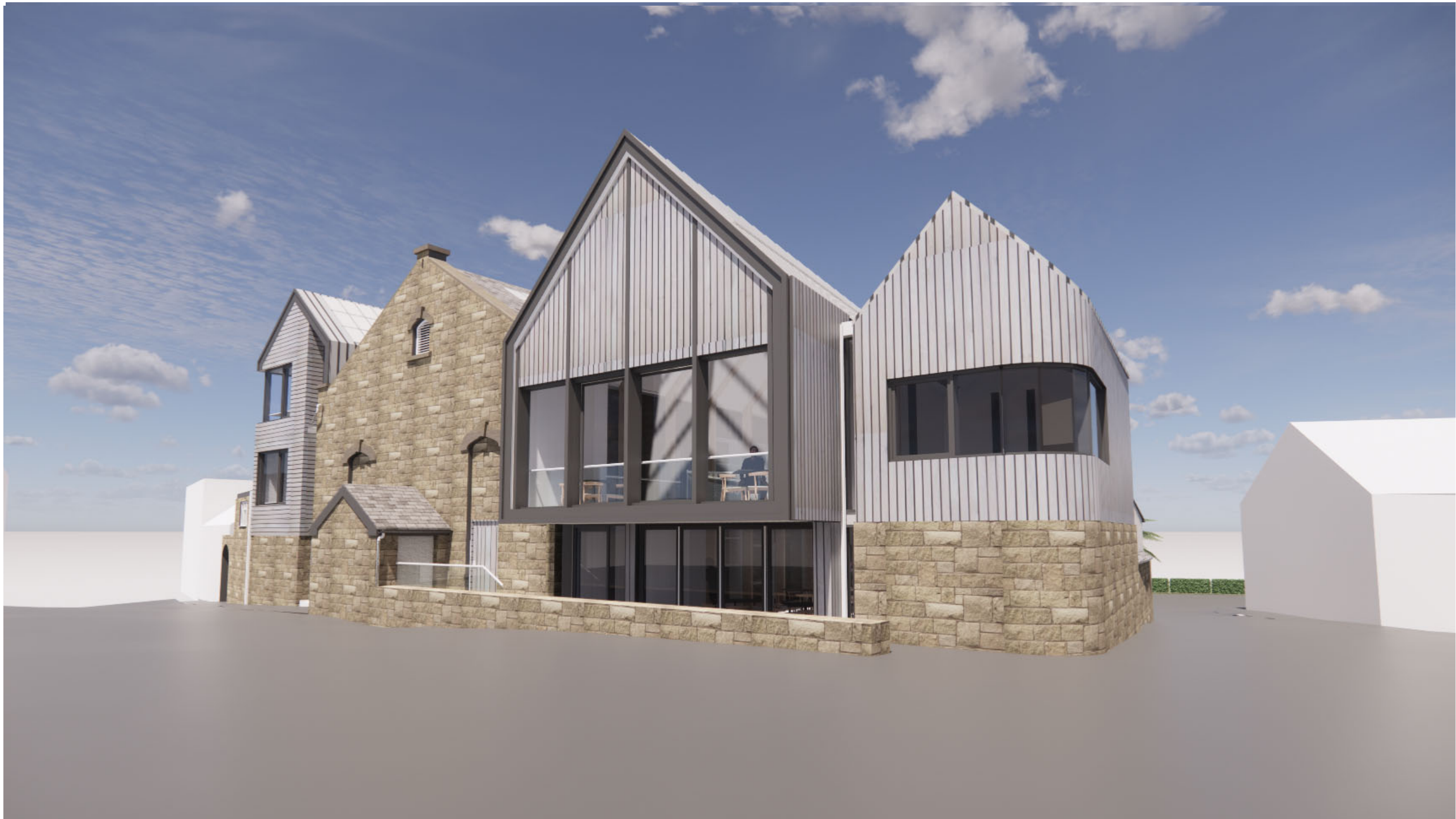
3. View from South East