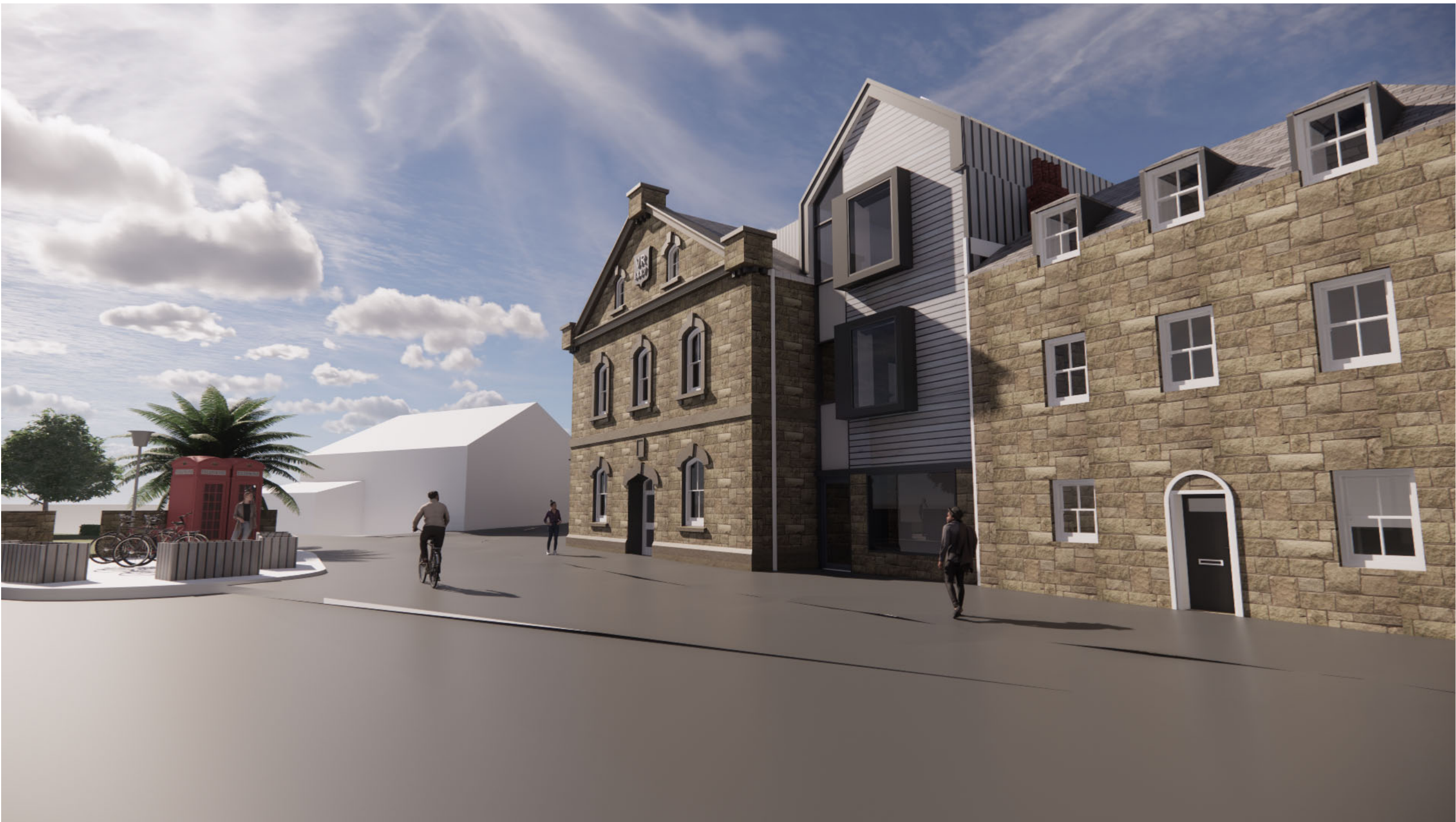
1. View from North West