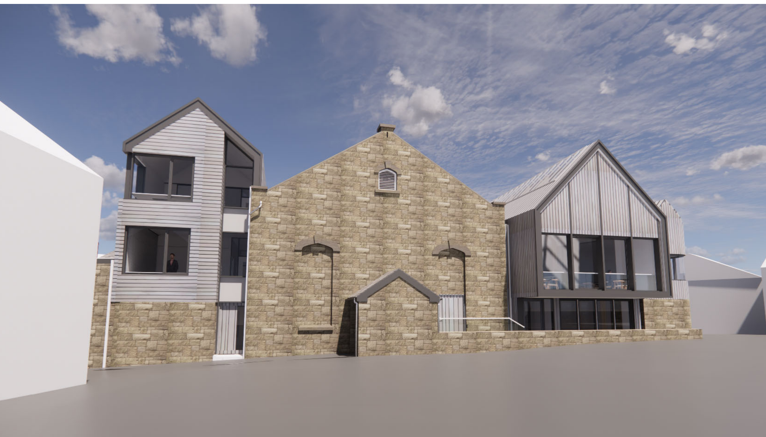
4. View from South West

Notes: Drawings are based on survey data and may not accurately represent what is physically present. Do not scale from this drawing. All dimensions are to be verified on site before proceeding with the work. All dimensions are in millimeters unless noted otherwise. Purcell shall be notified in writing of any discrepancies.