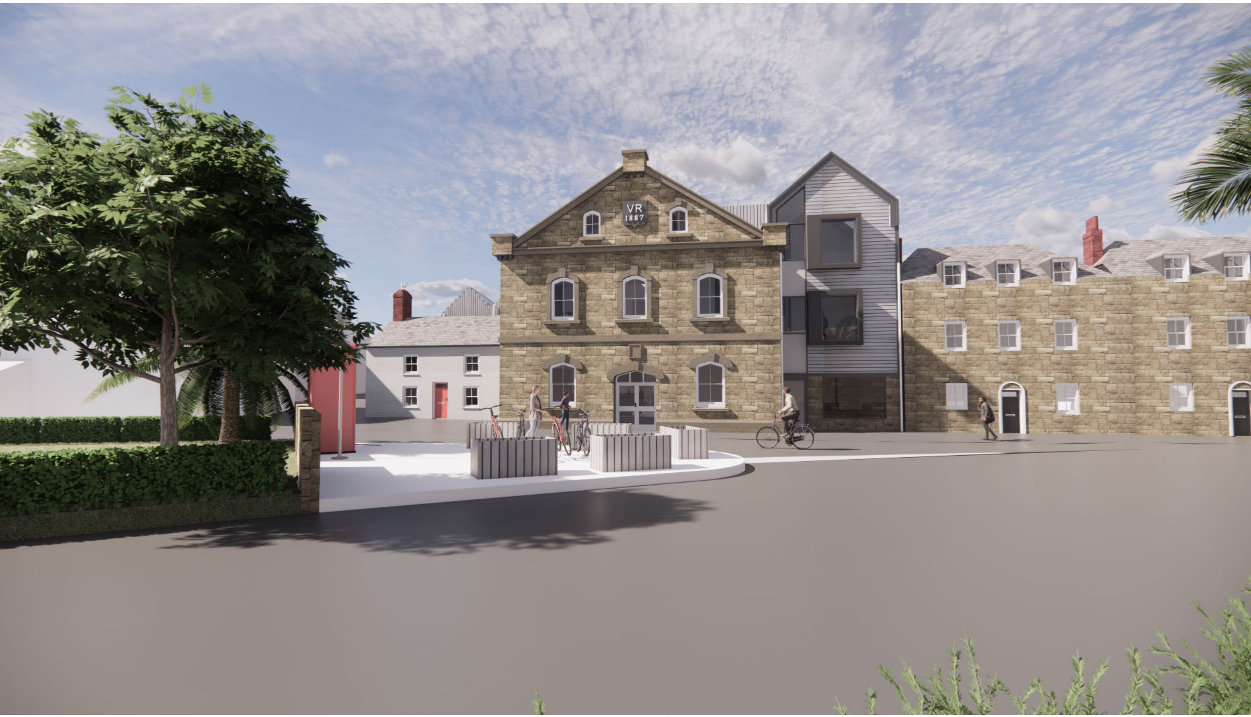
2. View from North near Parade Square