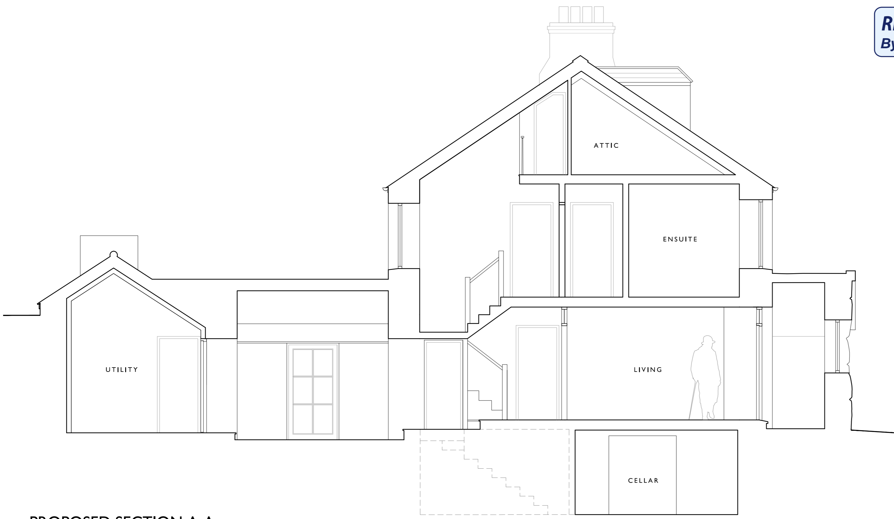
PROPOSED SECTION A-A

RECEIVED By A King at 1:37 pm, Jun 21, 2022