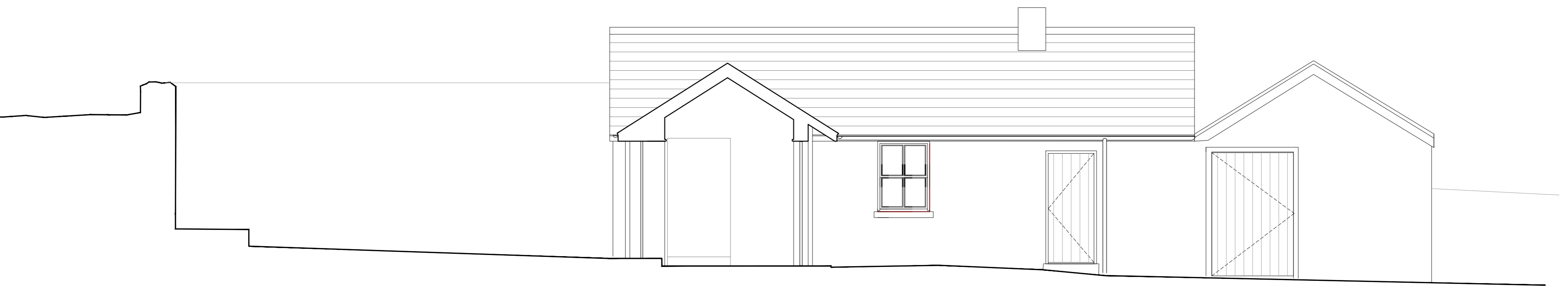
PROPOSED SECTION B - B